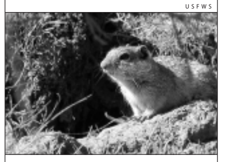
Southern Idaho ground squirrel in sagebrush habitat.

Others offered to help as the Service, IDFG, researchers, and local ranchers stepped up outreach efforts, which included magazine articles, news stories, and hunter education. The University of Idaho began to conduct genetic studies of the squirrels. Albertson College of Idaho contributed expertise and partnered with the