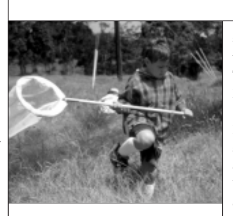
Children visiting the Keakealani Outdoor Education Center learn about natural history and the importance of saving endangered species and habitat.

his Hawaiian proverb's wisdom is expressed in many languages, but they all speak to the same hope: if you want to make the world a better place, begin by teaching children. In Hawaii — a state of unparalleled species richness that is also burdened by species extinction and endangerment — this legacy is vital.