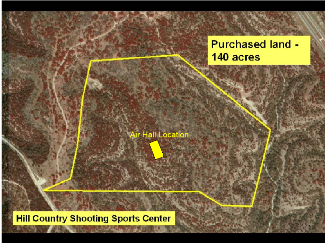
FIGURES 3-6: Aerial view of facility development