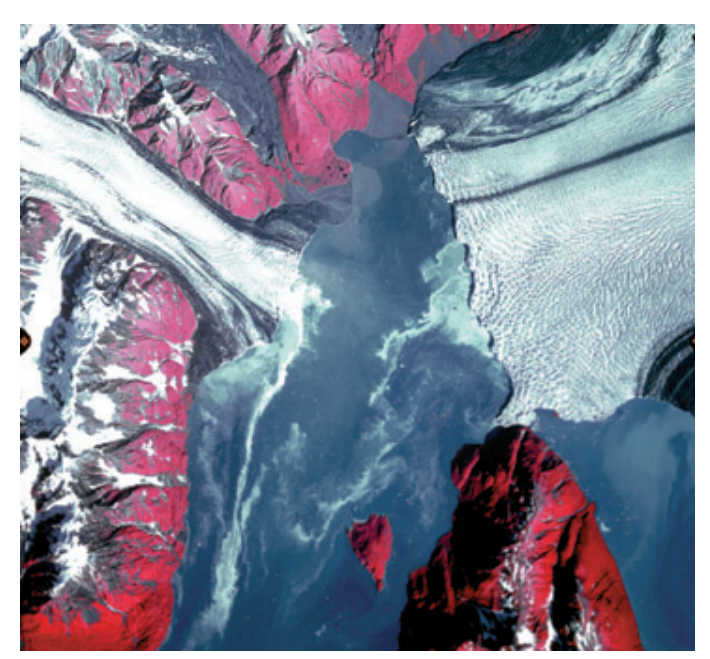
Hubbard Glacier on the coast of Alaska shows a spur of the glacier at the lower right temporarily blocking the outflow of Russell Fjord into Yakutat Bay.

Since Airborne Science's inception, the NASA U-2s and ER-2s assisted in developing satellite sensors by testing sensor prototypes or by simulating proposed configurations with existing systems.