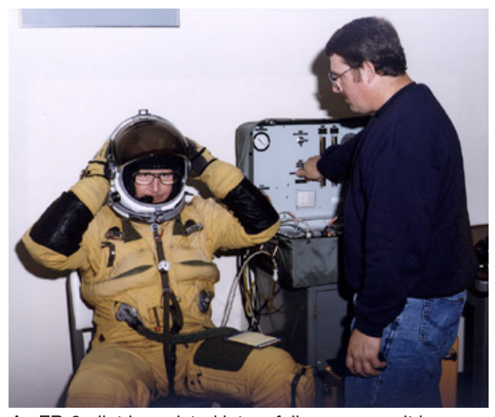
An ER-2 pilot is assisted into a full pressure suit in preparation for flight. The suit ensures survivabilty at high altitude in the event of aircraft cabin depressurization.

deployment sites in Australia, Chile, Costa Rica, the Fiji Islands, Maine, New Zealand, Norway and Sweden. Sites as far ranging as: Fairbanks, Alaska; Brasilia, Brazil; Alconbury, England; Topeka, Kan.; South Africa; Houston; Wallops Island, Va.; and Spokane, Wash., have allowed the ER-2 systems to acquire extensive digital multispectral imagery and aerial photography. These imagery missions have tested prototype satellite imaging sensors and have acquired Earth resources data for application projects sponsored by NASA and federal agencies such as the Forest Service, Environmen-