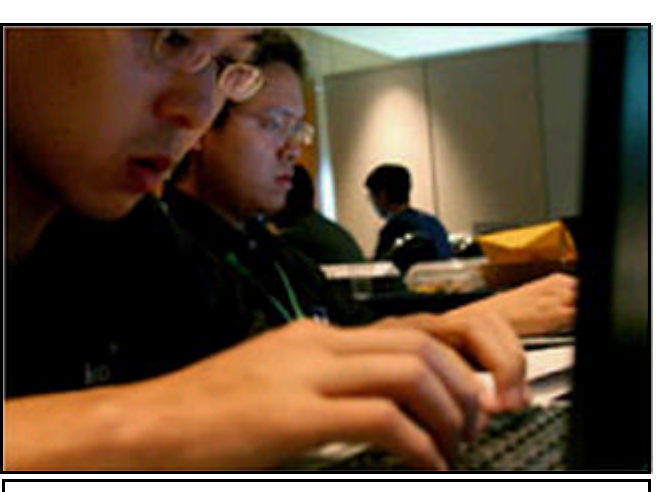
Hackers in Singapore look for sensitive information on the Internet

Washington -- The United States is gust&x = 20060807133221bcrekla ment authorities, see the U.S. Immigration and Customs Enforcement Web site on its Cyber Crime investigations/services/