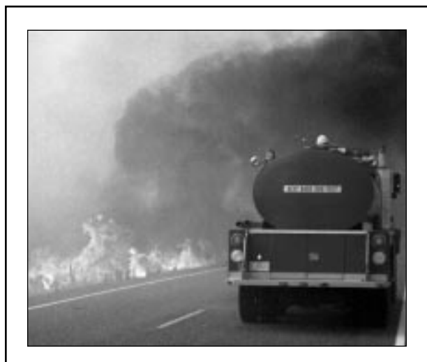
BRUSH FIRES — Ed Hahn (ED) took this photo along U.S. 20, about three miles from Argonne-West, shortly before the site was evacuated. According to early estimates, two fires just days apart burned about 50,000 acres.