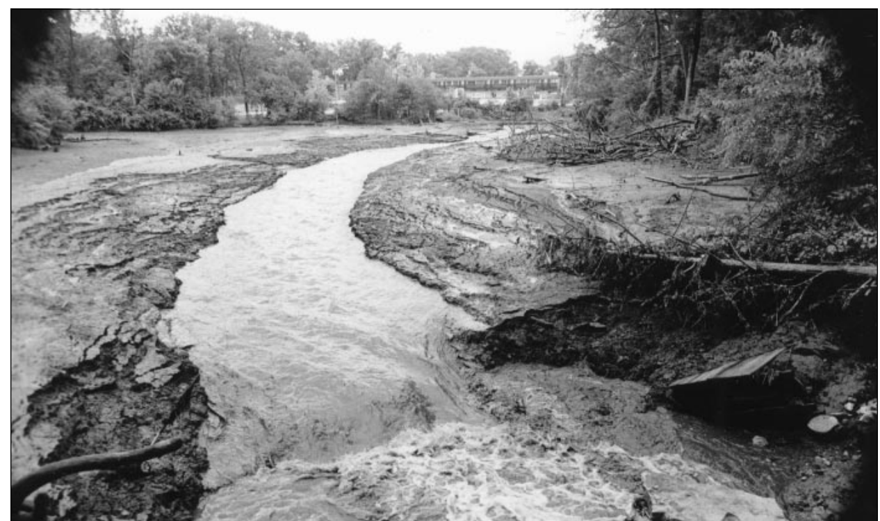
RAINSTORM — Above, Freund Pond disappeared after the dam at the east end of the "swan pond" burst under a torrent of rain July 17-18. At top, a cyclist watches the normally placid Sawmill Creek rage under the Eastwood Drive bridge. Below, water covers Cass Avenue and Northgate Road, shutting down the laboratory's main entrance July 18.