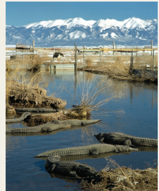
PIX 05872, NREL, Warren Gretz

Direct-use applications directly pipe hot water from geothermal resources to provide heat for industrial processes, crop drying, greenhouses, aquaculture, recreation, sidewalk snow-melting, and buildings. Geothermal district-heating systems supply heat to multiple buildings through a network of pipes carrying the hot geothermal water. Horticulture and aquaculture enterprises have demonstrated economic development benefits.