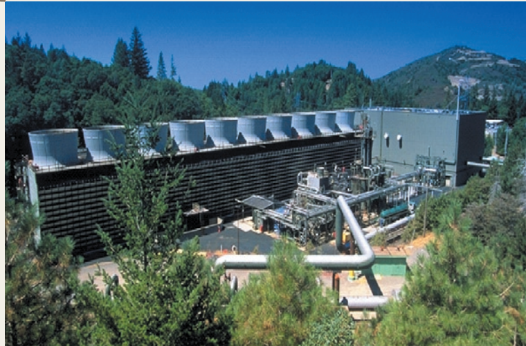
Pacific Gas and Electric Company (PG&E)