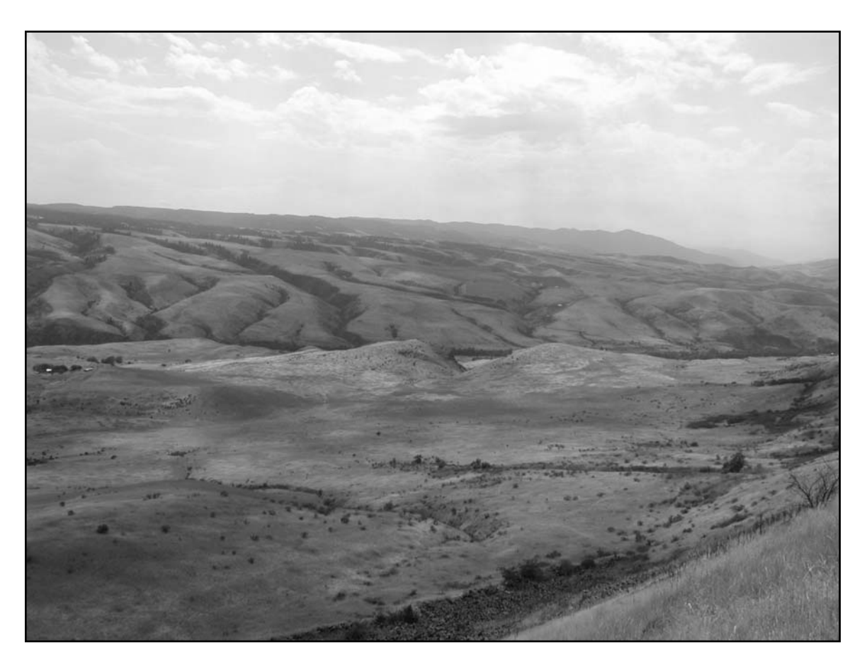
White Bird Battlefield as seen from the overlook on Highway 95.