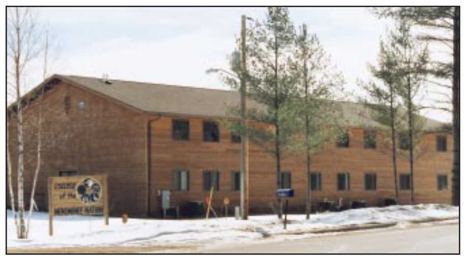
The College of the Menominee Nation is located at the south end of the Reservation at Keshena.

Five primary communities are located on the Reservation: Keshena, Neopit, Zoar, South Branch and Middle Village, as well as several other residential areas. We have two grade schools and a high school. The desire for educational advancement among Tribal members led to the establishment of the College of the Menominee Nation in 1992.