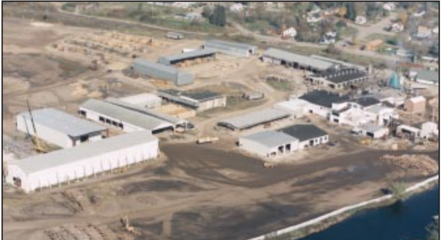
Aerial view of the Menominee Tribal Enterprises sawmill at Neopit.

Falls. Later that same site was the location of the Reservation's first hydroelectric facility. The present mill at Neopit was built in the 1906-1908 period and continues today.