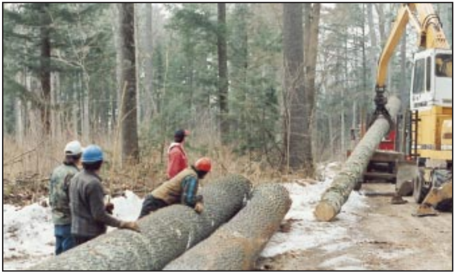
Harvesting White Pine logs for the masts of the Milwaukee Schooner Project.

Foresters evaluate each individual tree for removal. Trees past maturity, of poor quality or that are not likely to survive until the next cutting are harvested. Selection cutting works best for species that can regenerate in full shade like sugar maple, beech, hemlock, and basswood. The selection method results in a forest with all classes of trees.