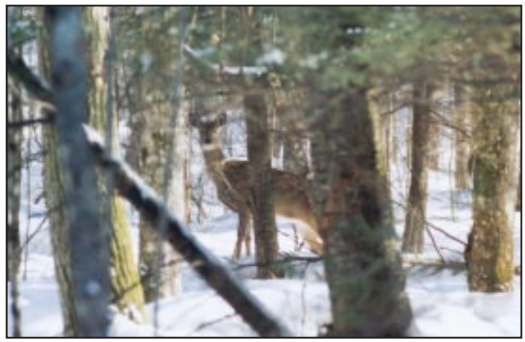
Wildlife abounds in the Menominee Forest

Visitors on guided tours to the Reservation are invited to appreciate our forest, quality wood products, traditional values and culture, and community members as much as we appreciate them.