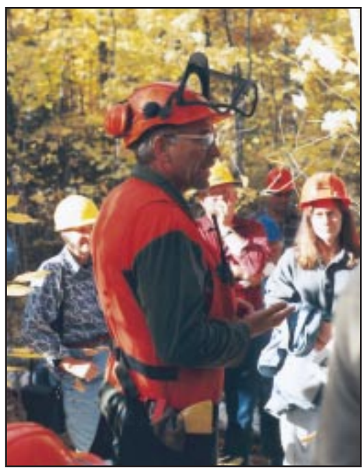
October 1996 Timber Harvesting Systems for Sustained Forest Management Symposium.

The Menominee Indian Tribe of Wisconsin is a federally-recognized sovereign nation, a status which gives us selfgoverning powers, privileges and responsibilities. We make our own tribal laws and ordinances. and have an established tribal police force and a tribal court system as provided in the Constitution and Bylaws of the Menominee Indian Tribe of Wisconsin.