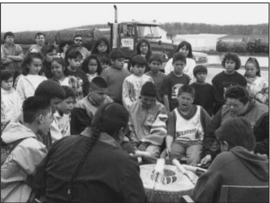
Menominee Tribal School Little Bear Singers offer a song during the dedication of logs which MTE donated as the masts for the Wisconsin Lakes Schooner Education Association Schooner Project.

This bounty cannot be measured in financial terms alone, but must include a balance of environmental, economic, cultural, community and spiritual values. Today celebrate the interconnectedness of the Creator's design so eloquently expressed by Mother Earth on the Menominee Indian Reservation.