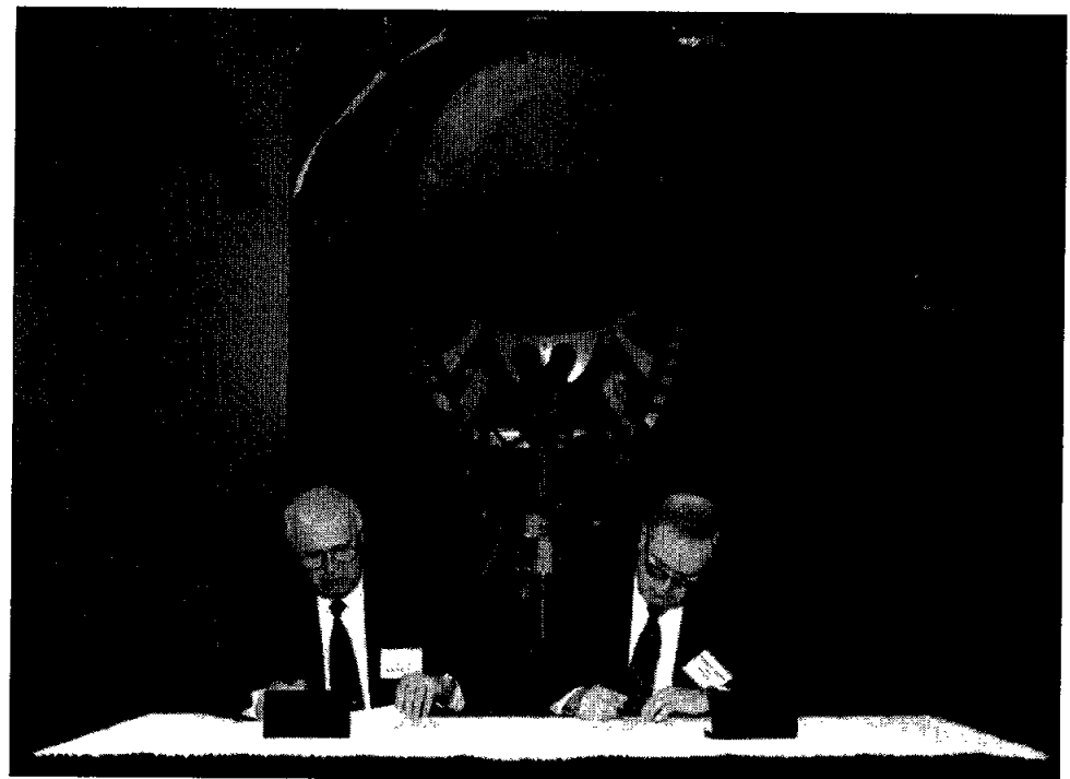
Arnold Aldrich and Yuri Semenov sign an agreement to continue studies on the use of the Soyuz TM capsule as a "lifeboat" for Space Station Freedom.

Perseus also is breaking new ground in other technologies like the onboard computer which will guide many of its flights using preprogrammed flight plans. The autopilot will keep track of the plane's location via signals from the Global Positioning System constellation of navigation satellites.