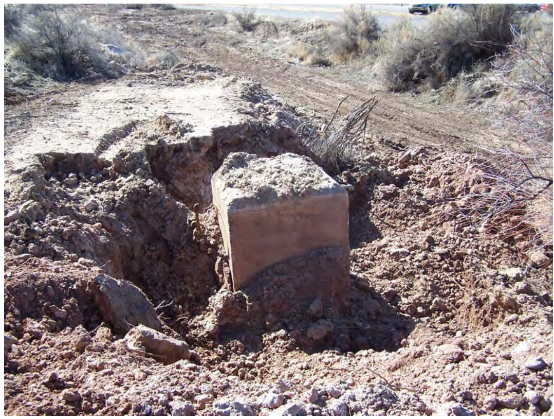
GJO 2/2008. PL-7. Excavated structure on adjacent property east of the site.