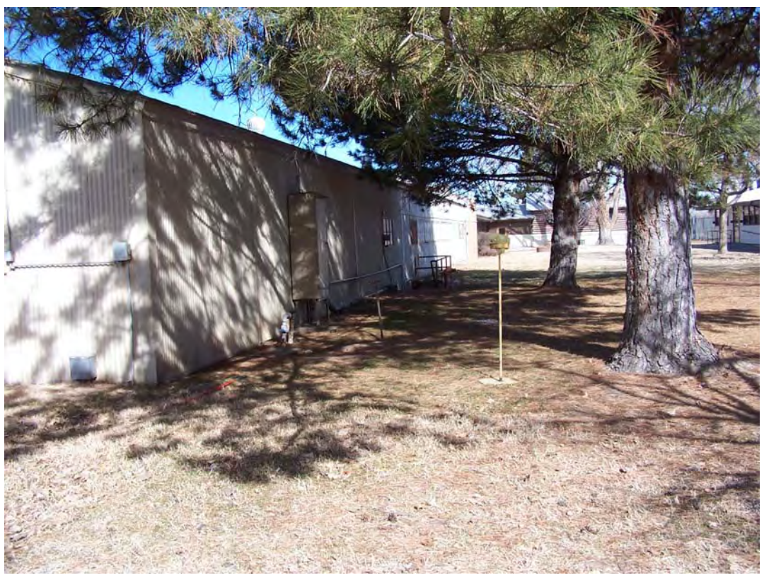
GJO 2/2008. PL-3. Southeast corner of Building 12A; no evidence of disturbance.