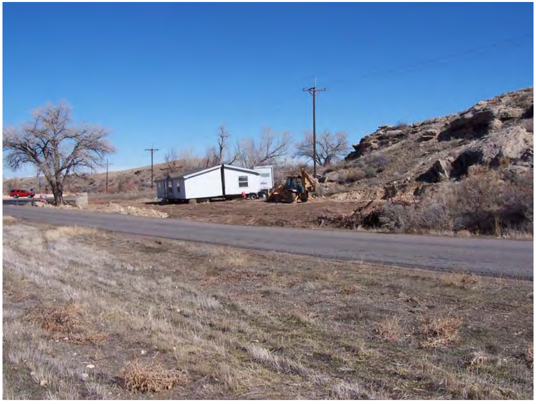
GJO 2/2008. PL-8. Private construction activities on adjacent property east of the site.