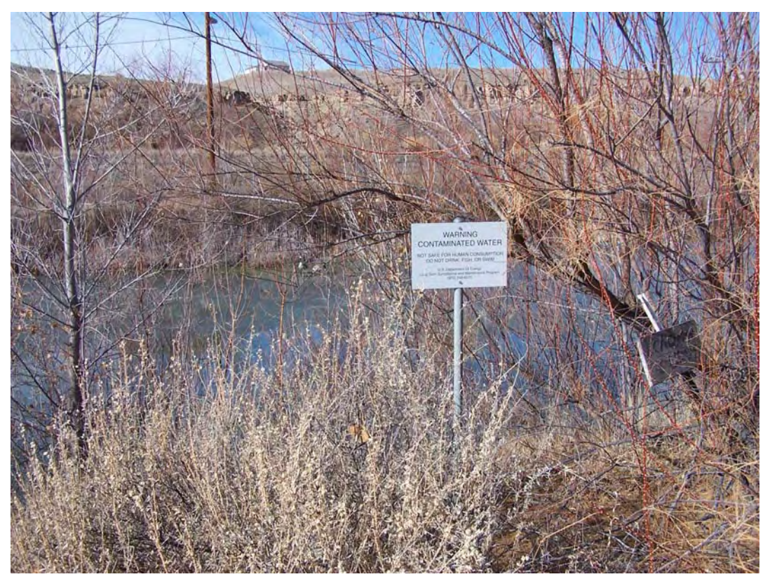
GJO 2/2008. PL-1. South Pond warning sign S5.