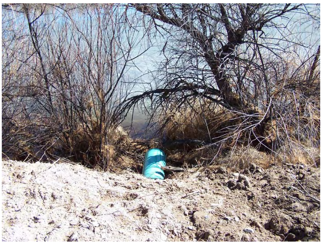
GJO 2/2008. PL-6. Outlet of new culvert at the edge of North Pond.