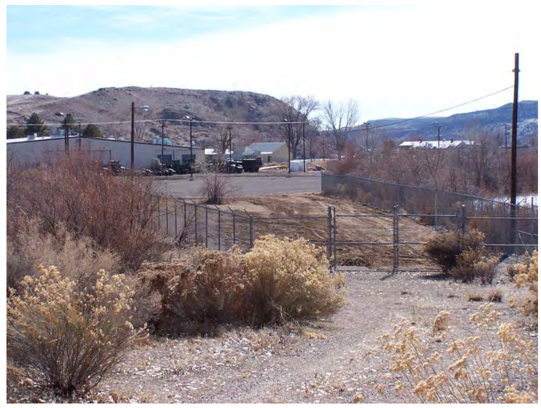
GJO 2/2008. PL-5. Recent grading on the U.S. Army Reserve property.