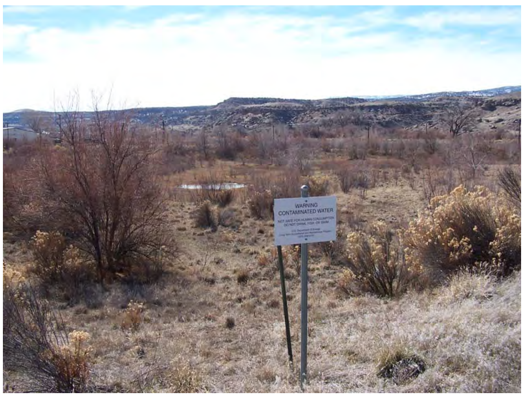
GJO 2/2008. PL-4. Warning sign S12 near a wetland area at the north end of the site.