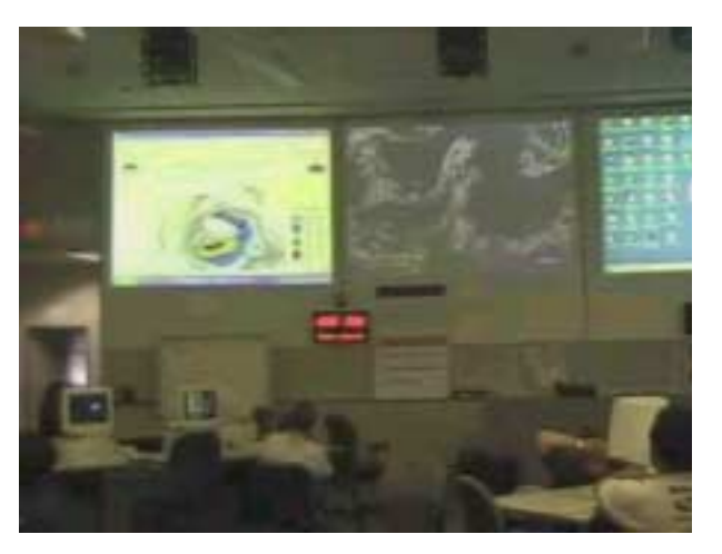
Figure 4. The SERFC's rain forecast is simultaneously being displayed on one of the large projection screens at the Florida Division of Emergency Management in Tallahassee, Florida.