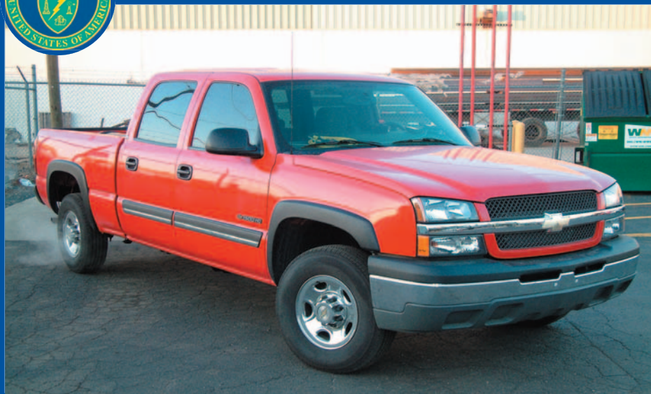
2005 Hydrogen ICE 1 Truck