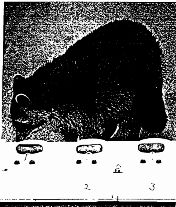
FIGURE 2. Bait platform with three bait types used to evaluate raccoon bait preferences for oral rabies vaccination.

With the exception of Tests 1 and 7, both the number of baits consumed and the order in which each animal selected individual baits were recorded. The order of bait selection was not