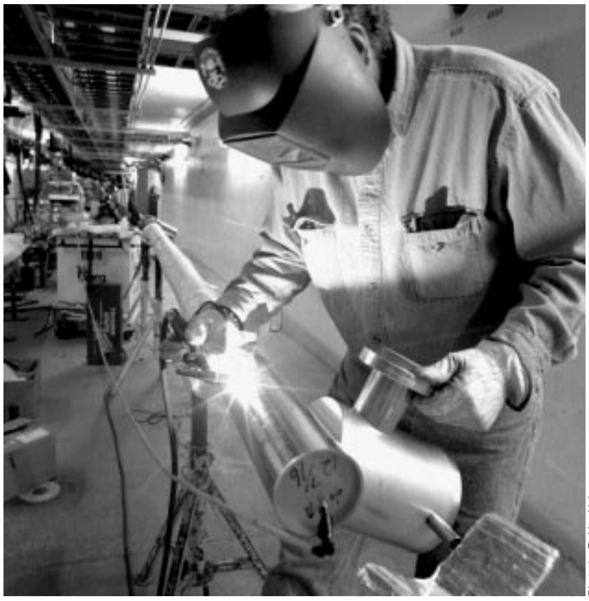
The Recycler contains two miles of beam pipes. Welding the vacuum tubes created airtight connections.

"There are a lot of major hurdles that still need to be crossed," Gattuso said. "But things are starting to come together." \Box