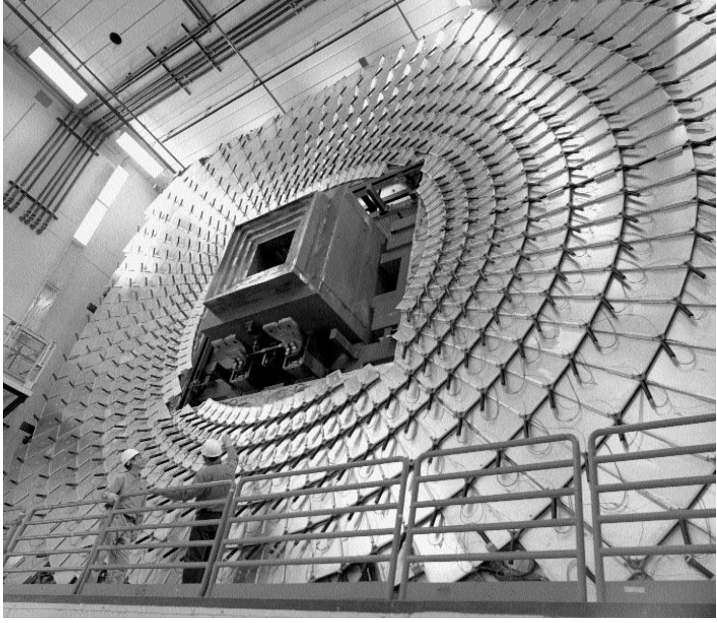
The 150-ton C-layer muon truss, part of the DZero detector, installed in the assembly hall. Above, time-lapse shots of CDF rolling into the beamline for a commissioning run.