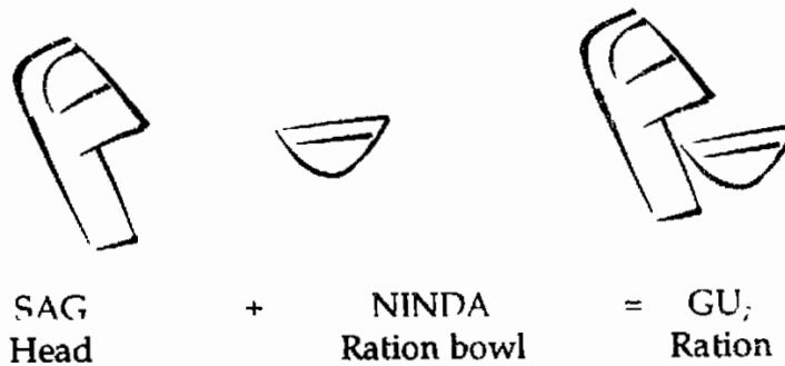
FIGURE 2. The composition of the sign GU 7 («apportioning of) ration«, later »eat« from »head« and »ration bowl«. We have no way to know whether the sign corresponded to a spoken circumlocution (later it did not) or was a mere graphic composition corresponding to a single word. From Nissen et al 1990: 51 (I have turned the signs back in their original position).

representing tokens came into use—so-called »numerical tablets« 24 .