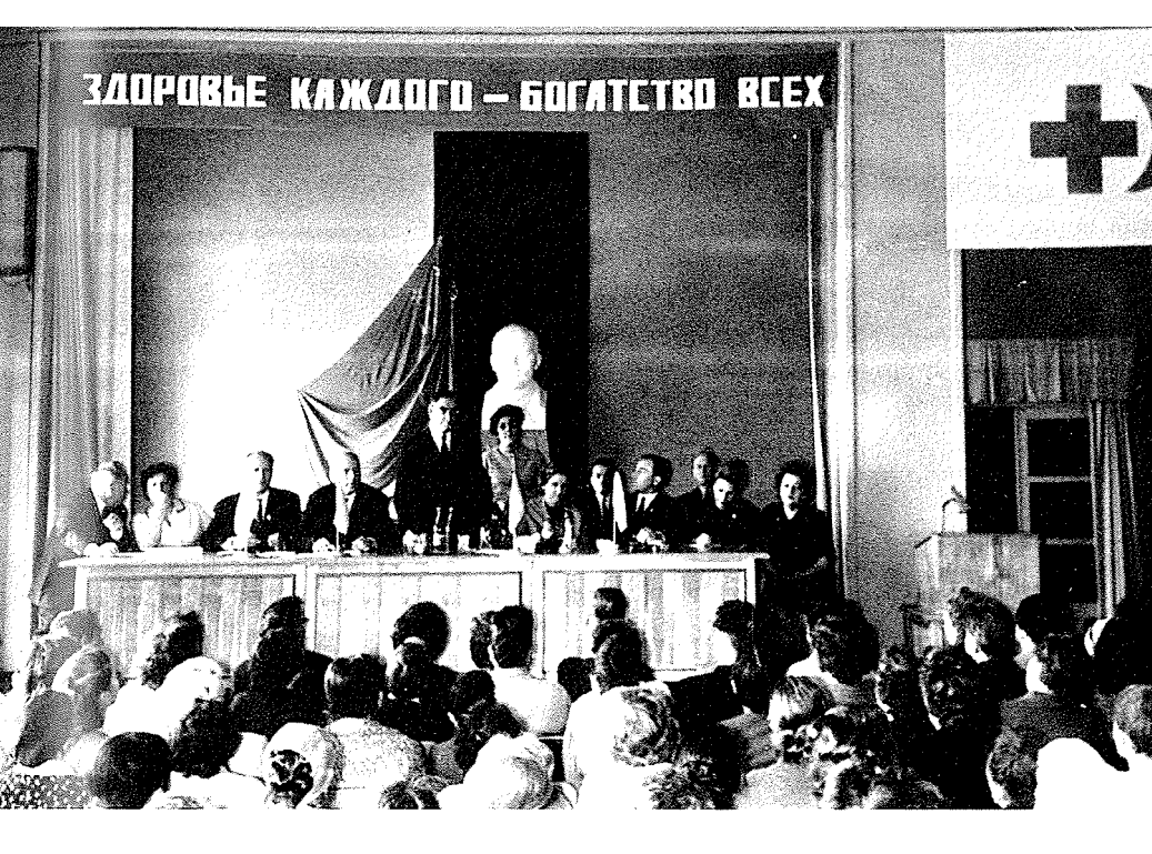
In the USSR , the President of the ICRC adressing a group of active members of the Red Cross of the Moscow area...

... and in Hungary, he attends a first-aid exercise by Red Cross Juniors.