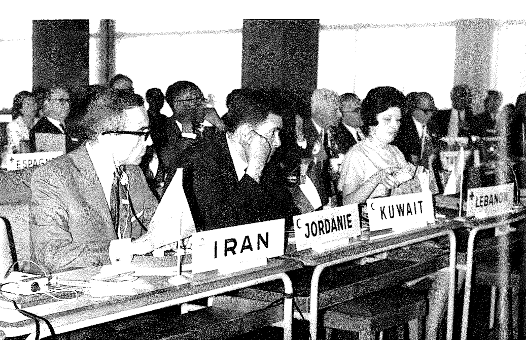
Rabat Seminar: A working session.