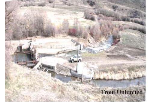
Fish screen and passage

Purpose: The FRIMA program provides financial assistance to local partners to correct impediments to fish passage related to irrigation and water diversion projects and facilities.