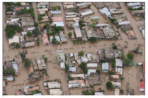
Tropical Storms produced flooding throughout Haiti. Efforts are underway to distribute much needed water, food, and supplies to the victims.

WFP, CRS, and WVI are currently distributing food commodities at their predetermined rate to meet their September targets. The USG Title II Haiti