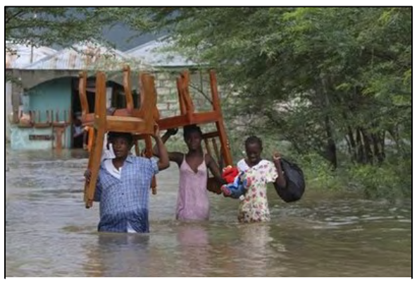
Tropical Storms produced flooding throughout Haiti. Efforts are underway to distribute much needed water, food. and supplies to the victims.

Haiti is the poorest country in the Western Hemisphere. The unemployment rate is nearly 80% and an estimated 78% of the population is living on less than $2 per day. Its crippling poverty contributes to chronic food insecurity, which was exacerbated by the recent rise in global food prices. In Haiti, the prices for stable foods have increased over 40% since the beginning of the year. The burden of steep increases in food prices is heaviest on the poorest Haitians living in urban slums and rural areas. In response to angry, violent protests staged in provincial towns and Port-au-Prince in April 2008 by Haitians unable to meet the rising cost of food, the international donor community increased measures to respond to the needs of the estimated 2.5 million who are most vulnerable to food insecurity.