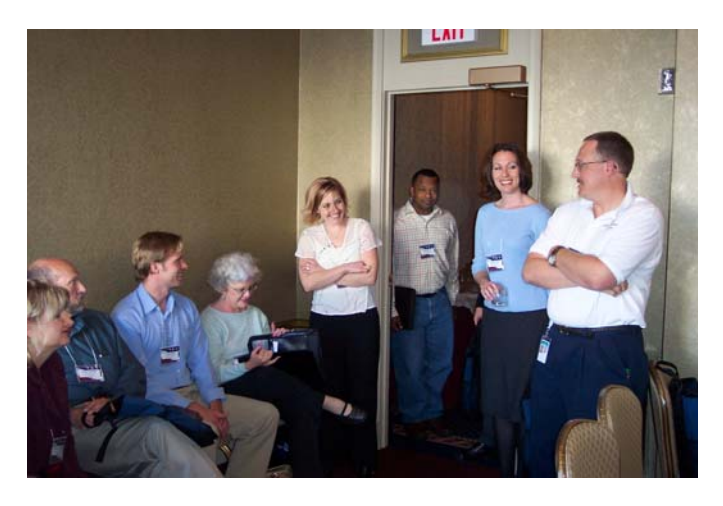
A break in the regional breakout session

The conference also featured a regional breakout session which allowed Region VII Medical Reserve Corps to meet their colleagues from across the region, discuss issues of mutual concern, highlight their unit's activities and accomplishments, and share best practices and lessons learned.