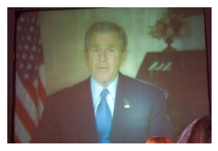
President Bush addresses the conference attendees by videotape

The conference also featured a regional breakout session which allowed Region VII Medical Reserve Corps to meet their colleagues from across the region, discuss issues of mutual concern, highlight their unit's activities and accomplishments, and share best practices and lessons learned.