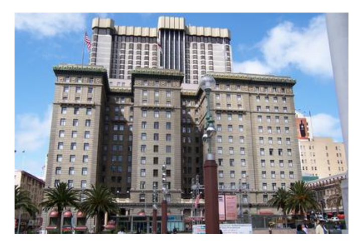
The Westin St. Francis Hotel on Union Square in San Francisco