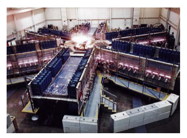
Figure 2: The existing Shiva Star 9-MegaJoule liner implosion machine at the Air Force Research Laboratory in Albuquerque, New Mexico.

Recently we won a 4-year renewal of the FRX-L MTF project from DOE, which authorizes the goal of combining our plasma injector with the AFRL "Shiva Star" linerimplosion system. Our direct collaborators include scientists from the University of Washington, University of Wisconsin, U of Nevada (Reno), General Atomics, LLNL, and students from around New Mexico and the nation. Over the next four year period, we will design and begin to build the first combined FRC plasma/liner implosion scientific demonstration experiments.