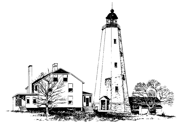
The Lighthouse at Sandy Hook

Since the days of exploration and colonization, Sandy Hook and the nearby Navesink Highlands have been prominent landmarks for ships approaching Lower New York Harbor.