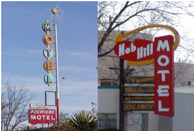
The Nob Hill and Premiere Motel neon signs will be restored to operating condition.