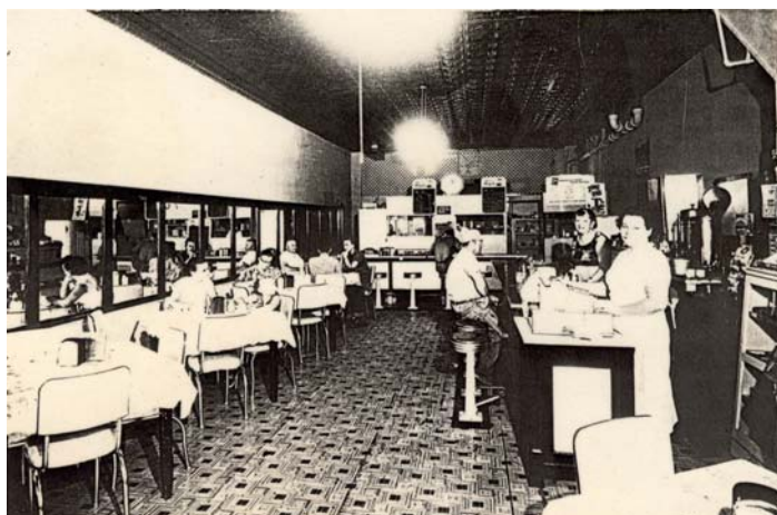
This circa 1940 photo of the Palms Grill Cafe in Atlanta, Illinois, shows the Café in operation. Funds have been awarded for the repair of the roof and building façade.