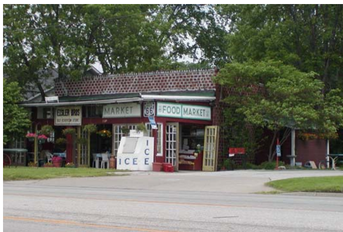
The roof and electrical system of the Eisler Bros. Store in Riverton, Kansas, will be repaired and upgraded.

The Atlanta Public Library and Museum Board will begin the restoration of the historic Palms Grill Cafe in Atlanta, Illinois. Based on a preservation plan prepared in 2004, the façade will be restored, and the roof replaced. Constructed in 1867, the building operated as a café and Greyhound Bus station on Route 66 from 1934 into the 1960s. Long-term plans are to restore the exterior and interior of the cafe to its 1940s appearance, and to resume cafe service. The building was placed on the National Register of Historic Places in 2004.