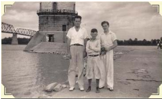
The oral history project will interview known Route 66 experts and archivists regarding the whereabouts of known collections and repositories of information. Photo: visitors at Chain of Rocks Bridge, Missouri/Illinois border.