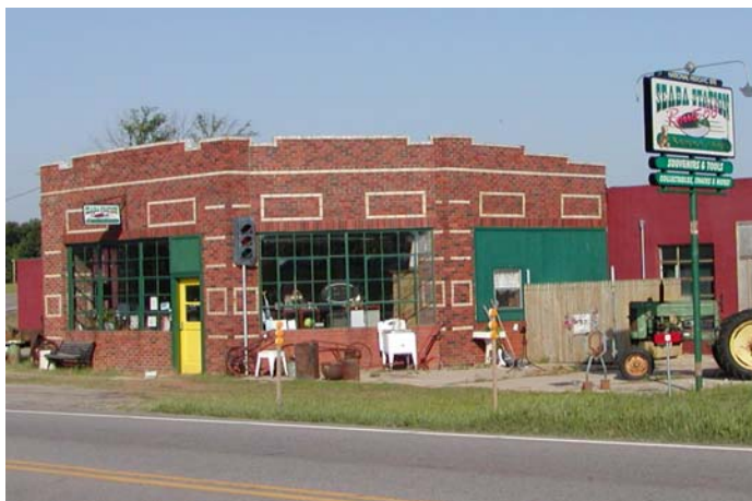
The Seaba Station near Chandler, Oklahoma, will receive repairs to the main building and the privy.