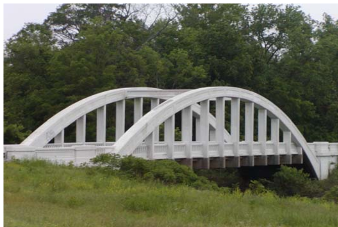
Repairs will be made to the concrete superstructure of the Brush Creek Bridge located in Cherokee County, Kansas.

The Eisler Bros. Store located in Riverton, Kansas, will receive a new roof and electrical system upgrade. Built in 1925 as the “Williams’ Store,” the building housed a multi-function business that included a restaurant, grocery, general merchandise store, and gas station. It served countless travelers who stopped during the Route 66 years for directions, food, coffee, and gas. In 1973 the building was purchased by the Eisler family, and has continued to operate as a general store and popular Route 66 destination. The building was placed on the National Register of Historic Places in 2003.