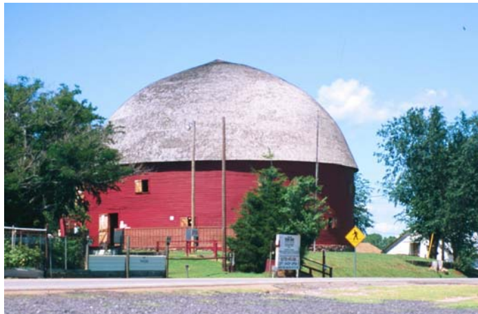
The Round Barn in Arcadia, Oklahoma, will receive roof, siding, window, and door repairs.