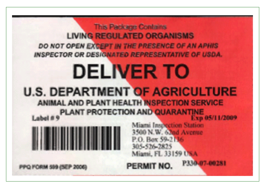
FIGURE A-1-45: Example of PPQ Form 599, Red and White Label with Bar Code