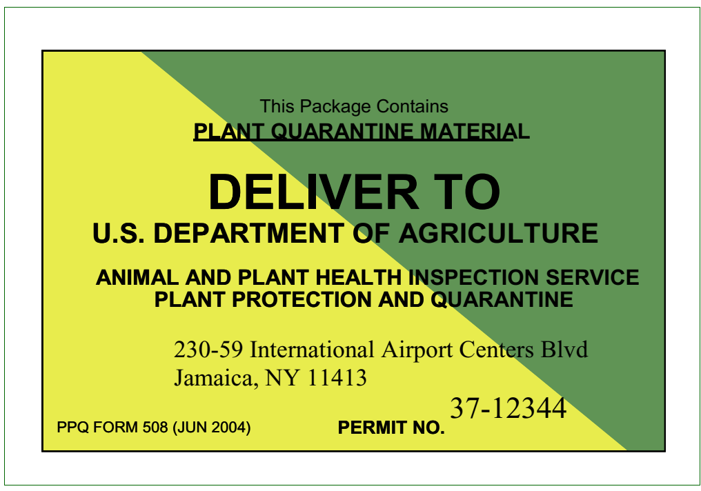
FIGURE A-1-38: Example of PPQ Form 508, Green and Yellow Label without Bar Code