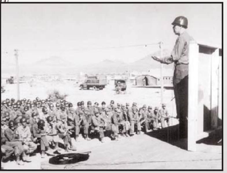
Soldiers are briefed at Camp Desert Rock for an atmospheric nuclear test on Yucca Flat. It was the fourth test in the Buster-Jangle series, and the fourth test where military personnel were deployed from Camp Desert Rock.

received orders to serve with the U.S. Army's Atomic Maneuver Battalion working at Camp Desert Rock at the Nevada Test Site.