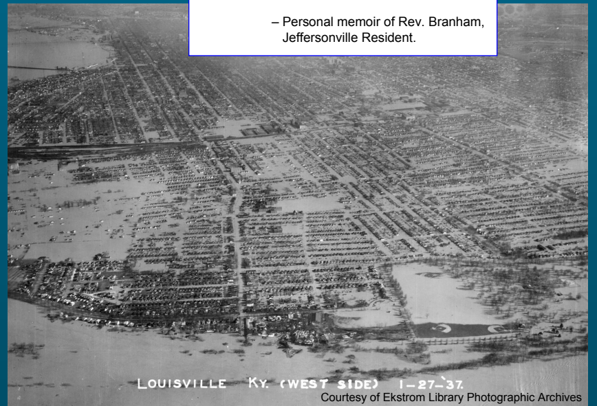
Inundation of western Louisville looking east toward downtown.