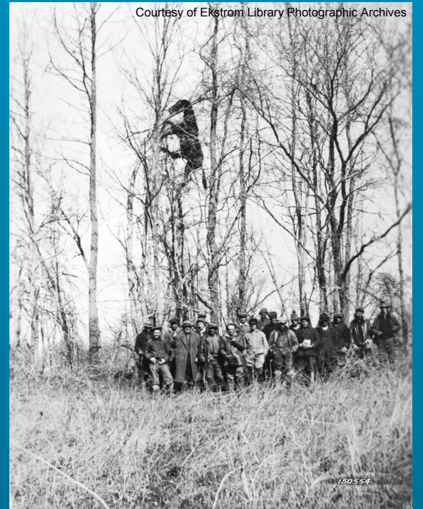
Horse caught in branches of a tree several weeks after flood crest.