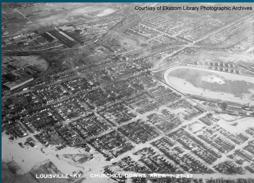
Widespread flooding at and around Churchill Downs.