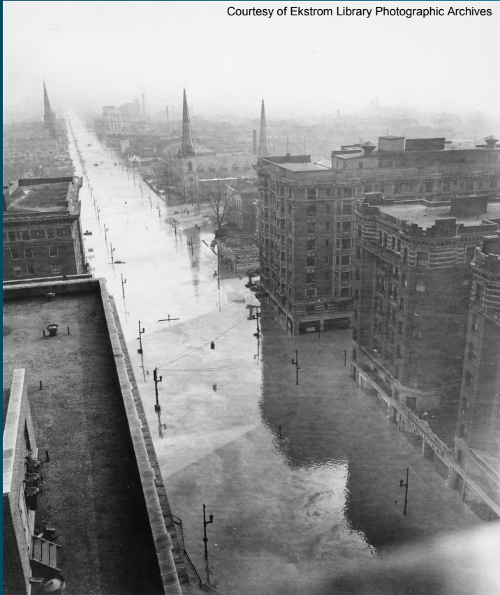
Looking east down Main Street.

The Ohio River Great Flood of January 1937 surpassed all previous floods during the 175 years of civilized occupancy of the lower Ohio Valley. Exceeding the floods of 1884 and 1773, geological evidence suggests that the lower Ohio Valley flood of 1937 outmatched ANY previous flood. The whole city of Paducah was inundated; 35,000 people were evacuated. Seventy percent of Louisville was submerged, forcing 175,000 residents to flee. One estimate of damage, in 1937 dollars, was 250 million!