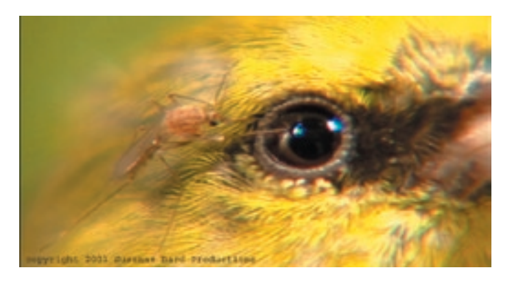
Figure 2. A southern house mosquito ( Culex quinquefasciatus ) bites an ' amakihi . While continental birds typically defend themselves against blood-feeding mosquitoes, Hawaiian birds are more tolerant of biting mosquitoes and more likely to become infected with disease. Culex mosquitoes feed most actively at night, when birds are roosting.