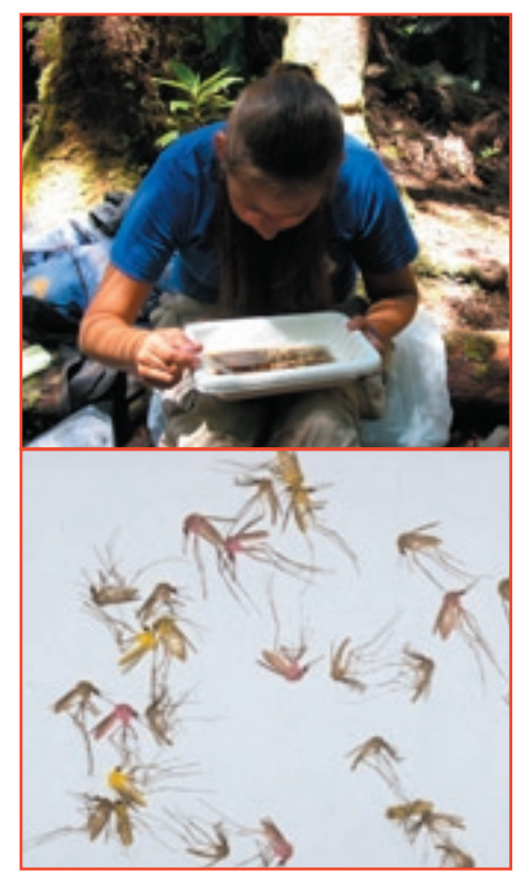
Figure 6. Mosquito egg rafts and larvae were collected from tree fern cavities found at several different forest sites. Tree fern cavities may contain several hundred larvae in less than a liter (quart) of water.

Figure 7. Mosquitoes reared in the lab were marked with fluorescent powder, released in the forest, and captured in traps set up in a grid around the release site. These studies help to determine the maximum and average distances that Culex mosquitoes will travel.