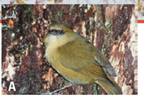
Figure 1. The extant species of Hawaiian honeycreepers found in the wet forests on Hawai'i Island. A: Hawai'i Creeper, Oreomystis mana (endangered); B: 'Akepa, Loxops coccineus (endangered); C: Apapane, Himatione sanguinea; D: Hawai'i 'Amakihi, Hemignathus virens; E: 'I'iwi, Vestiaria coccinea; and F: 'Akiapōlā'au, Hemignathus munroi (endangered).

these diseases, however, could have become so widely established if mosquitoes had not been accidentally introduced to the Hawaiian Islands.