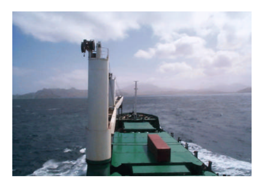
A U.S.-flag ship carrying P.L. 480 commodities to the Cape Verde Islands. (Summer 2000)

The MOU required MARAD to reimburse CCC for allowable shipping costs associated with incremental OFD and excess ocean freight costs. However, the MOU did not address how to treat any differences in requested versus actual reimbursements. Determining the causes of MARAD's adjustments to CCC invoiced amounts could possibly provide over $187 million in additional reimbursements for reprogramming, if those amounts turn out to be allowable and thus reimbursable costs. At a minimum, by reconciling the differences between requested and paid reimbursements, CCC might be able to account for the losses and avoid such losses in the future. Consequently, we believe that USAID should request that CCC reconcile the $187 million in rejected reimbursement requests and jointly establish procedures with CCC to follow-up/reconcile all such differences in the future.