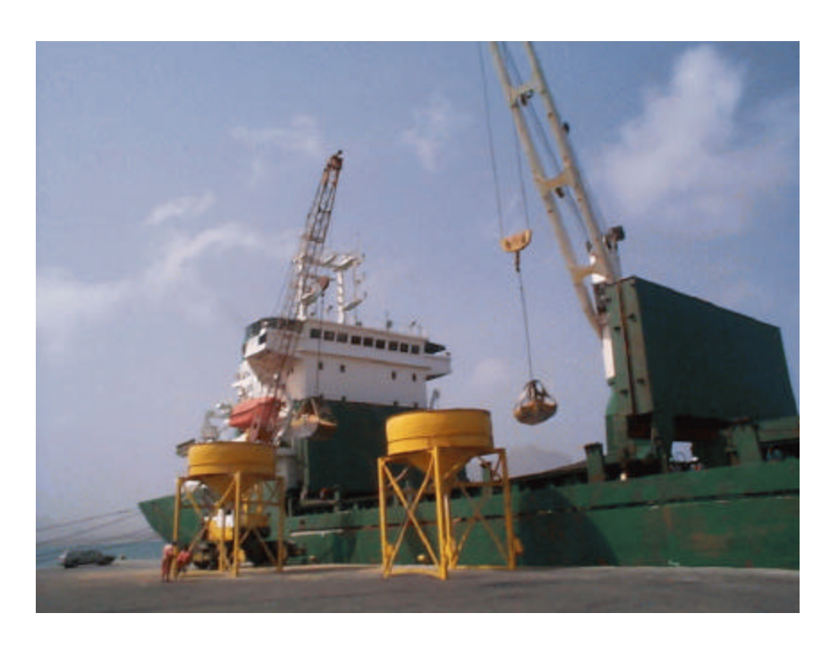
Cranes unloading bulk corn at port in Cape Verde Islands. (Summer 2000)

The following are some additional areas in which, we believe, changes to the procedures in the current MOU could improve the efficiency and effectiveness of the cargo preference reimbursement process.