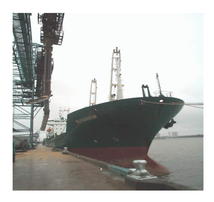
U.S.-flag vessel docking at a foreign port to deliver food assistance cargo. (Summer 2000)

The procedures for implementing those new funding responsibilities, to be administered principally by the Department of Transportation's Maritime Administration (MARAD) and the Department of Agriculture's Commodity Credit Corporation (CCC), were outlined in a 1987 Memorandum of Understanding<sup>8</sup> (MOU) signed by representatives of MARAD, CCC, and USAID. This MOU described procedures regarding the calculation, request, and payment of cargo preference reimbursements. According to the MOU, MARAD was to, upon submission and approval of agreed-upon documentation, reimburse CCC for the following two types of shipping costs: