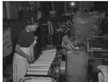
The U.S. Government Printing Office and the Office of the Federal Register are partners in publishing the daily Federal Register . Here a GPO employee operates one of the bindery machines, ca. 1960.

Although the Office of the Federal Register is not often directly involved in litigation, in 1995 and 1996 the Office became entangled in a lawsuit