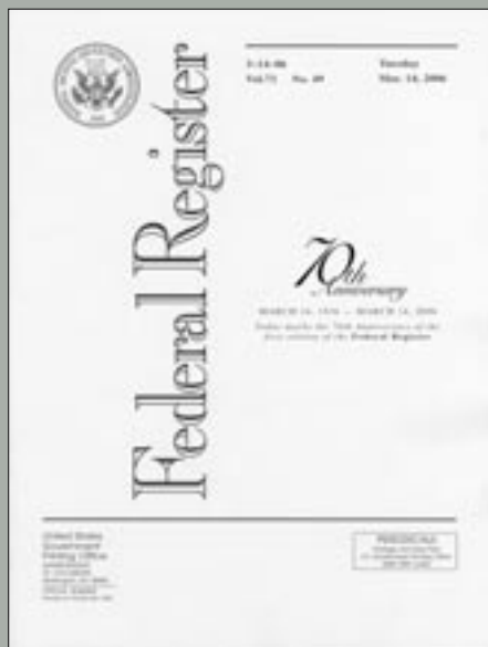
Cover of the Federal Register , March 14, 2006.