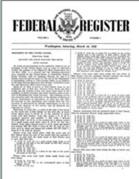
First cover of the Federal Register , March 14, 1936.