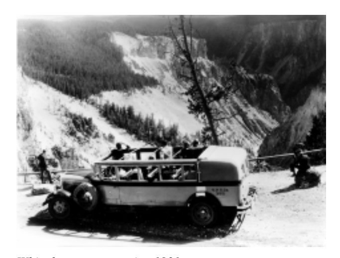
White bus at canyon rim. 1931.

I have been seriously concerned over the lack of patronage of the hotels and transportation lines. These operations, carried on under Government supervision and at rates approved by the Government, have suffered big losses, largely because of the decline in rail travel. The