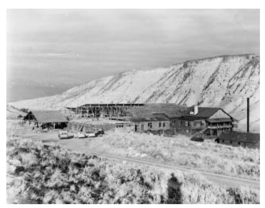
Mammoth Lodge being demolished. 1949.

lodge-type facility. Vernon Goodwin was eager to determine the needed number of cabins throughout the park as well as the best design for them. He considered the possibility of following the design of the Swiftcurrent Cabins in Glacier National Park, but because 100 cabins needed to be built in 1936, cost became a factor.<sup>24</sup>