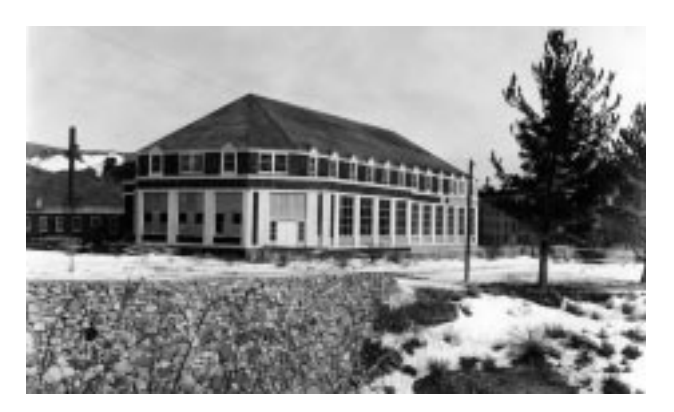
Mammoth dining room. 1937.

Late in 1939 at a National Park Service conference was held in Santa Fe, new policies were issued for park concessioners. One new policy required concession operators to "include with plans of public facilities submitted for approval, details as to cost of construction, proposed rates, and estimated revenue expense, and resulting net profit, to provide reasonable assurance of satisfactory operation of the proposed facilities on a socio-economic basis." The government strongly favored the development of accommodations outside park boundaries; in fact, in many of the newly created eastern parks, a policy was being formulated "whereby only the daytime needs of visitors for gasoline, oil, food, and picnic supplies shall be met by operations within the parks."33 Another new policy that received high visibility required the use of park timber instead of logs in the constructing new lodges in the park. In a letter to President Franklin Roosevelt, Secretary Ickes explained that in order to preserve "the scenic and natural conditions within the parks and monuments," only "material salvaged from clearings for roads, buildings, or other developments, or from insect and tree disease control and fire hazard reduction operations" could be used for construction