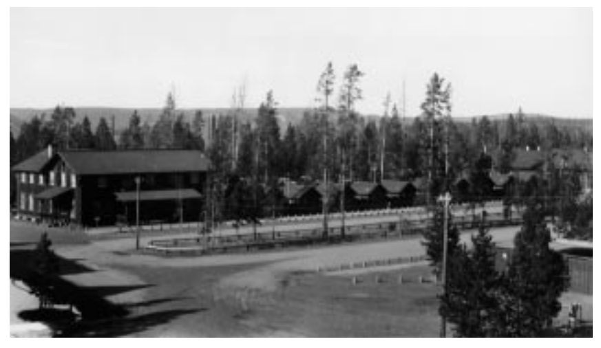
Old Faithful area—housekeeping office and cabins. 1934.

It is the opinion of this conference that the importance of the airplane problem in connection with travel to the National Parks should be recognized and that study should be made to determine the extent to which facilities shall be