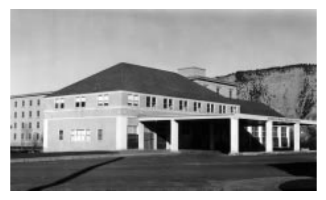
Mammoth Motor Inn. 1953.

500 to 700 trailers had come into the park since 1936.31