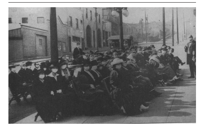
Sunday church services were often held outdoors during the 1918–1919 influenza pandemic, as shown here in San Francisco.

Figure 2. Sunday church services in San Francisco, 1918–1919