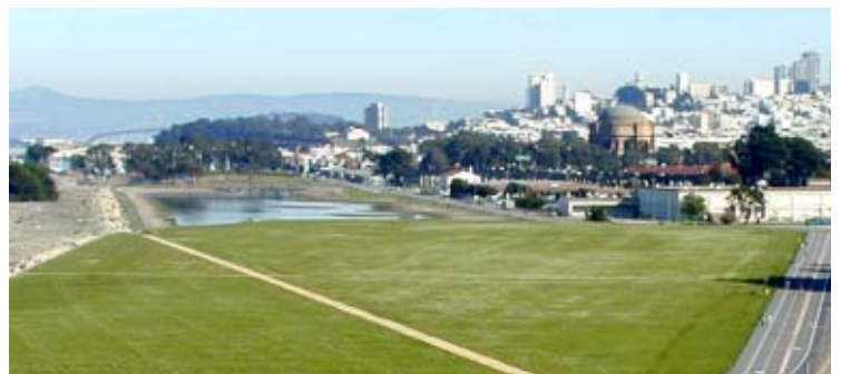
The site of the fair today.