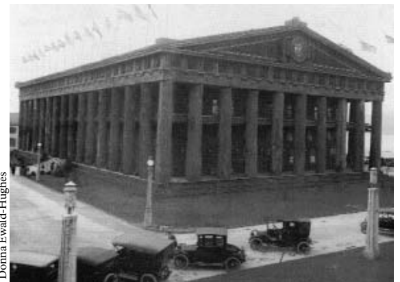
The Oregon Exhibit Hall.

Many of the cultural perspectives presented by the nations, states, and corporations that exhibited at the fair would be seen today as insensitive to indigenous peoples and women. This was not surprising: the fair was a celebration of the prevailing notions of the day, not an examination of them.