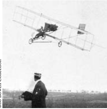
Lincoln Beachy flying the Little Looper at the fair.

The Panama-Pacific International Exposition looked to the future for innovation. It was intended to showcase new technologies and how they were making the world a better place. Things we take for granted today—cars, airplanes, telephones, and movies—were in their infancy and were shown off at the fair, and some well known technological luminaries were involved in the fair.