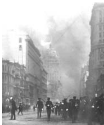
San Francisco 1906.

In 1903 President Theodore Roosevelt announced that the U.S. would complete a canal across the Isthmus of Panama, begun years earlier by a French company. The canal would cut 8,000 miles off the distance ships had to travel from the east coast to the west. No canal of this scale had been built before, and many said it could not be done. The geopolitical effects of the canal on the ascendancy of the United States on the world stage were profound.