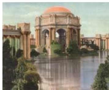
Palace of Fine Arts.

The Panama Pacific International Exposition closed in November 1915, just nine months after it opened. It succeeded in buoying the spirits and economy of San Francisco, and also resulted in effective trade relationships between the United States and other nations of the world.