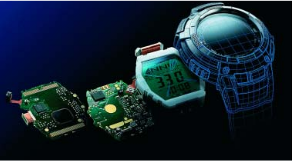
4. An "exploded" view of a multi-region RCW

good job of 'hiding' their ferrite bar or loop antennas inside the case, but there are still limitations on how small these antennas can be before they cease to be effective.