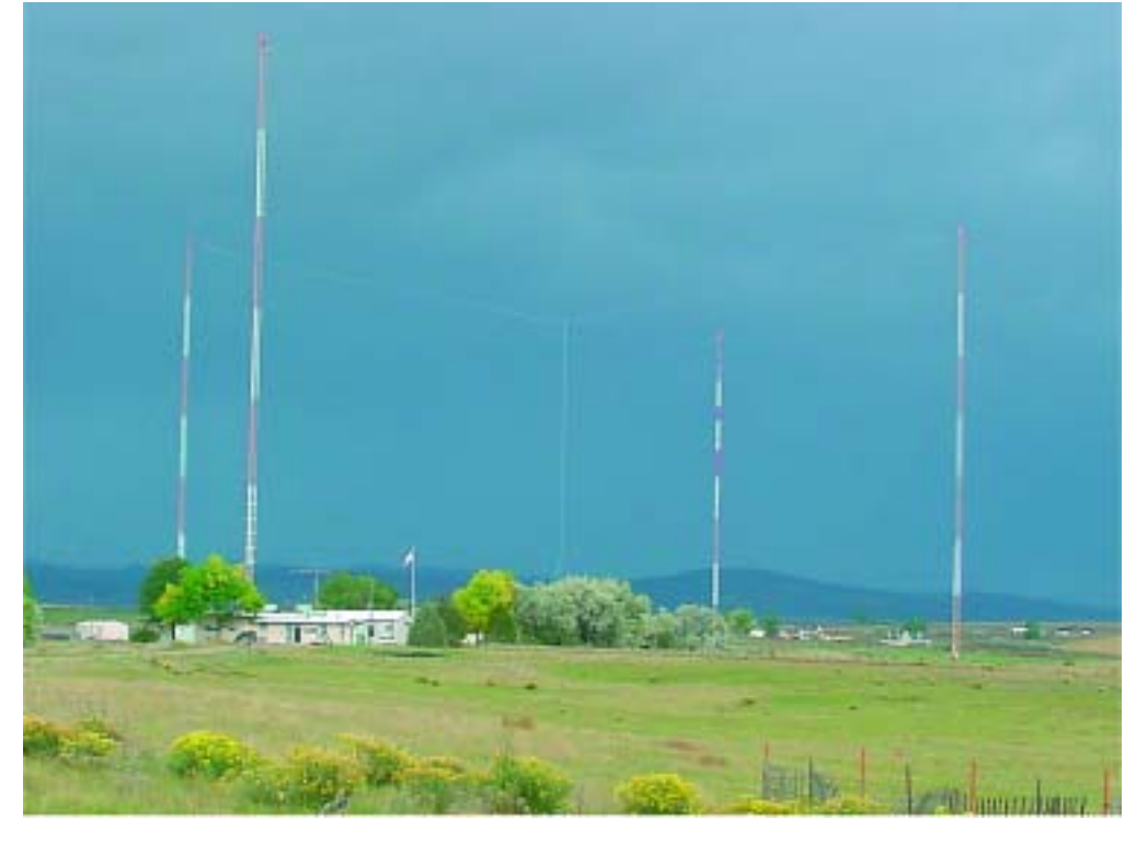
3. Radio Station WWVB, near Ft. Collins CD, transmits time signals for RCWs in the US.

Where does the time code come from? Most RCWs get the time from the national laboratory that is responsible for maintaining and distributing the official time for the country. For example, the National Institute of Standards and Technology (NIST) is an official source of