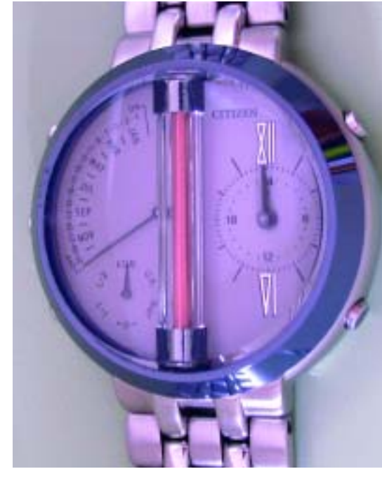
5. An early RCW produced by CITIZEN, with the antenna visible inside the dial, now a sought-after collector's item.

8 WWVB Radio Controlled Clocks: Recommended Practices for Manufacturers and Consumers, NIST Special Publication 960-14, 2005. (available for download from http://tf.nist.gov/general/pdf/1976.pdf)