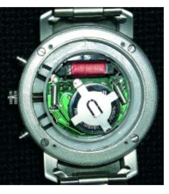
2. Rear view inside of a low-cost RCW, with two crystals and the antenna visible.