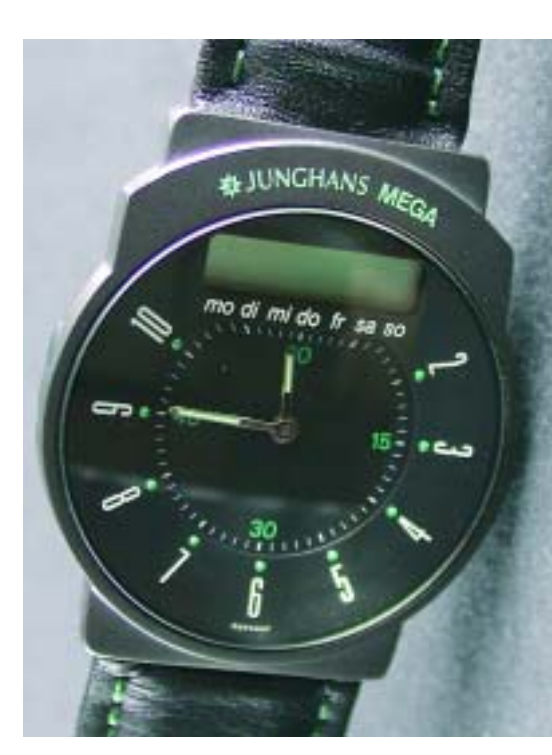
1. Junghans MEGA 1, 1990

have so far been produced in much smaller numbers. The first RCW, 1, was probably the JUNGHANS Mega 1, whose introduction in 1990 was hailed by one reviewer as 'one of the most momentous horological events ever'. 7 Even so, RCW sales remained modest throughout the 1990s, with the products found only in speciality shops, mail order catalogues, and advertisements in airline magazines. Today, however, the watches are easy to find and sales are rapidly expanding. For example, CASIO, which offers a variety of models through its Waveceptor line, reported sales of 2.3 million RCWs in 2005, with an estimated 1.1 million sold in Japan, 700,000 sold in the United States, and 500,000 sold in Europe. Many consumers now realise that RCWs have a clear advantage over conventional periodically because they watches; synchronise to international references, they are on time, all the time. In addition, prices have plummeted to the point where they cost just slightly more than conventional quartz watches of similar quality.