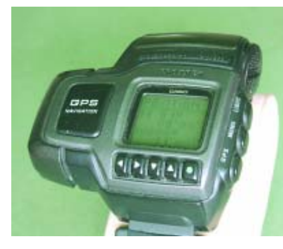
7. GPS wristwatch

Most of the other types of RCWs are designed to work with some type of mobile messaging technology. At least two major