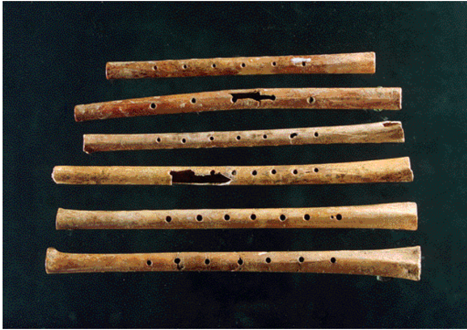
These six bone flutes, 7,000-9,000 years old, were dug from the early Neolithic site of Jiahu, Henan province, China. The flute second from bottom may be the oldest playable instrument in the world.

Jiahu lies in the Central Yellow River Valley in mid-Henan Province and was inhabited from 7,000 B.C. to