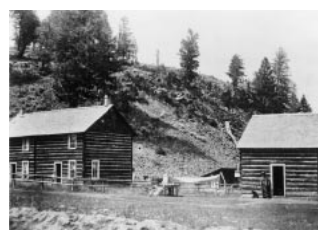
Yancey's Hotel. 1905.

Mammoth Hot Springs 3 acres Norris Geyser Basin 1 acre Lower Geyser Basin 2 acres Grand Canon 2 acres Yellowstone Lake 1 acre Thumb or Shoshone Lake 1 acre