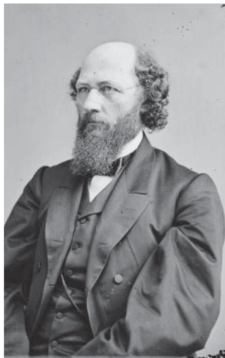
Justice Stephen J. Field

Justice Field became particularly influential for his interpretations of the Fourteenth Amendment, ratified in 1868. Drawing on natural rights theories, Jacksonian beliefs in limited government and free labor, and laissez-faire economics, Field viewed the Fourteenth Amendment as a broad protection of individual liberty from undue government interference. He relied on the amendment to strike down government regulations, such as the federal income tax, that he believed interfered too much with private enterprise, sought to redistribute wealth, or created what he thought were