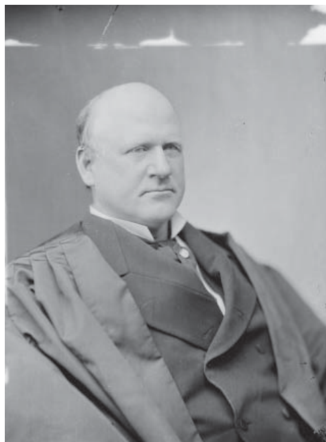
Justice John Marshall Harlan

Harlan was more ambivalent about the place of Chinese in the American republic. While he argued that the nation had an obligation to extend rights to African Americans, Harlan shared many of his contemporaries' views of Chinese as a distinct and foreign race who would not assimilate. In 1898, for example, Harlan joined Chief