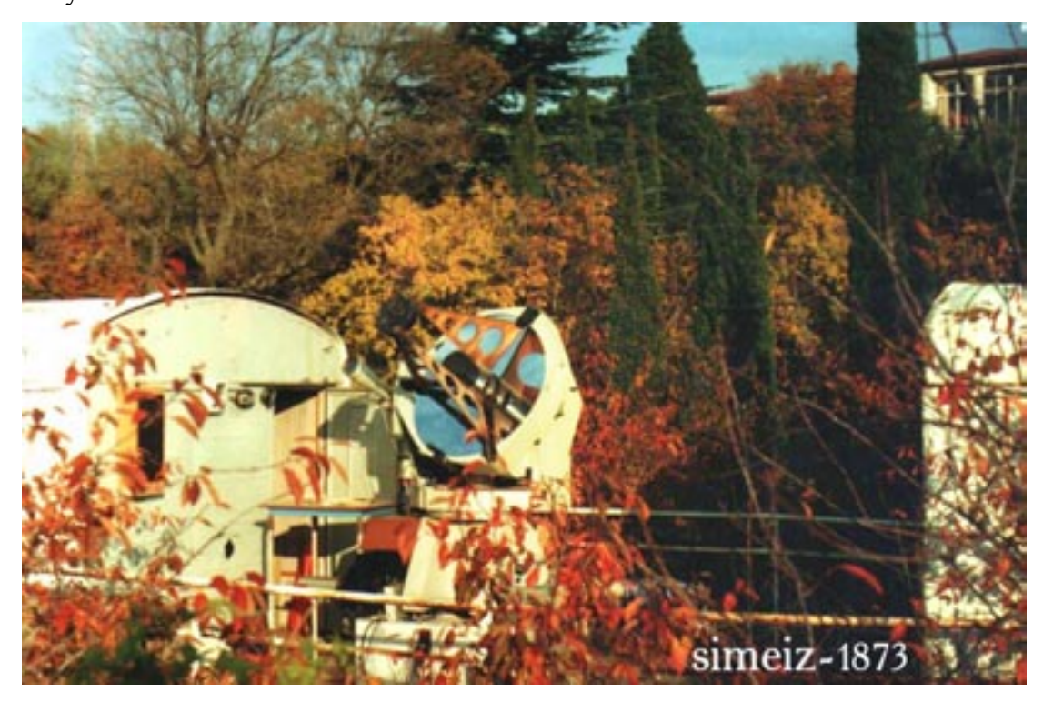
Figure 2. SLR station "Simeiz-1873"