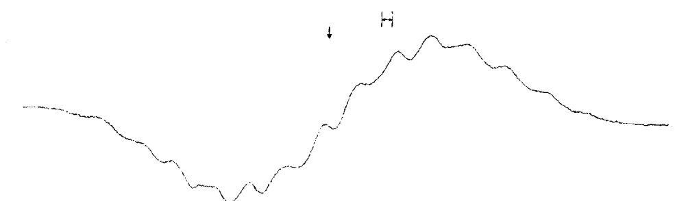
FIG. 1.—First derivative ESR spectrum of 10^{-2} M FMN in acid solution reduced by zinc. Marker indicates one gauss. Arrow indicates free electron resonance position.