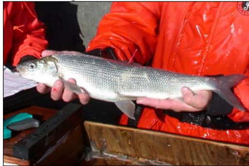
Alpena FRO staff floy tag and release lake whitefish near Middle Island, Lake Huron.