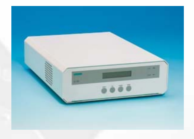
CI94 Temperature Programmer

The CI94 is programmed using the supplied Linksys temperature control software, Active-X controls or by using a set of serial commands (available on request). This enables the hotstage system to be incorporated into a more complex experimental setup such as FTIR or image analysis.