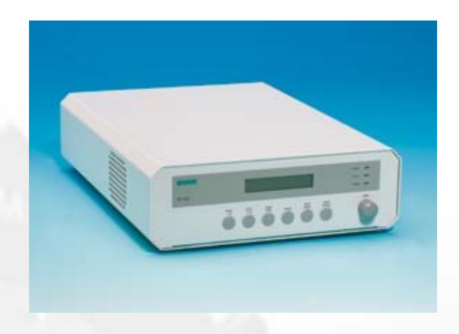
The TP94 Temperature Controller

The TP94 has been specifically designed to give precise temperature control of the Linkam range of heating/freezing Stages. Digital linearisation of the stage's sensor gives accurate temperature values whilst the function keys have been carefully chosen to allow rapid changes in data values.