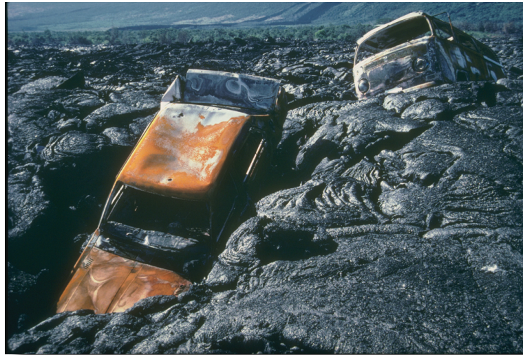
Two automobiles are all that remain after this section of Royal Gardens subdivision was overrun by lava (October 7, 1987). During October the footpath from a road into the housing area was covered, cutting residents off from the few homes that remained.

The TRANSITION ZONE divides the lower mantle from its upper portion. The Transition Zone starts at a depth of 250 miles and is roughly 190 miles thick. The temperatures here are much cooler than the lower mantle, around 1,600 degrees Fahrenheit.