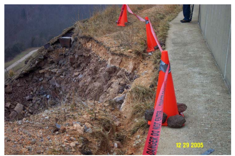
Figure 4.6 - Panels 48 and 49 Scarp near toe of parapet wall footing Note erosion rut adjacent to the footing