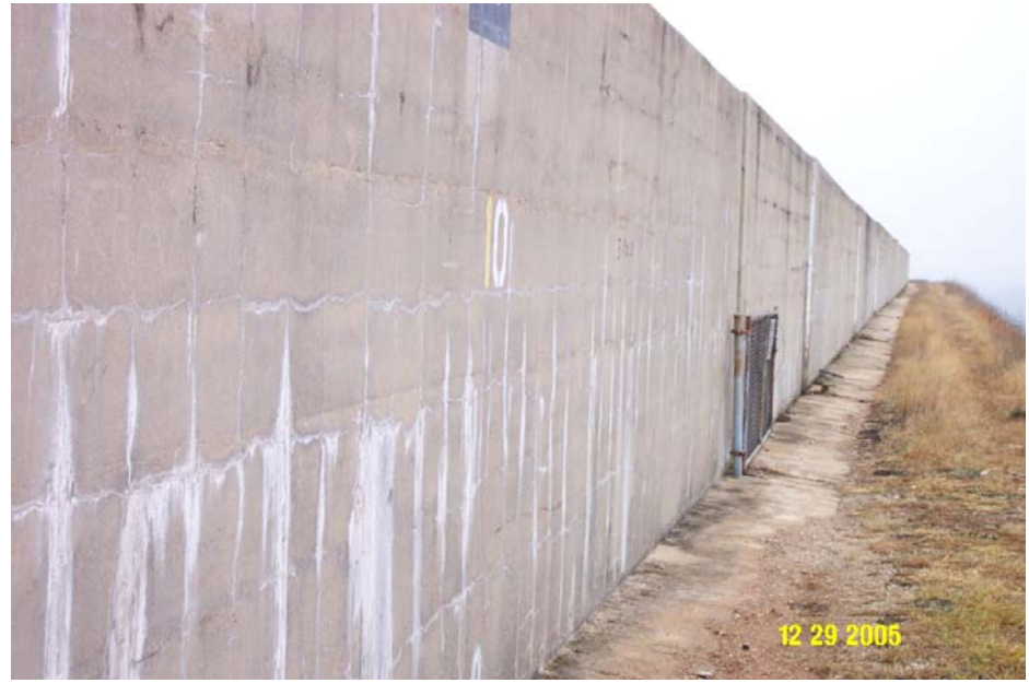
Figure 4.2 - Panel 10 Note grass is lain over near footing Damage from overtopping was judged as Minimal Estimate 0.1 ft. of overtopping