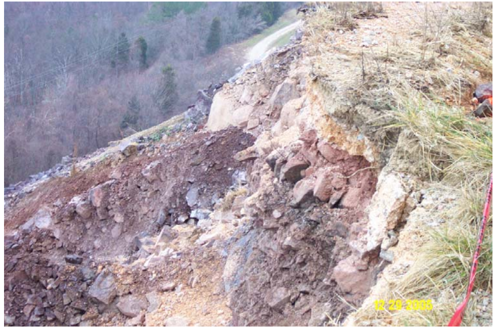
Figure 4.5 - Panels 48 and 49 Scarp near toe of parapet wall footing