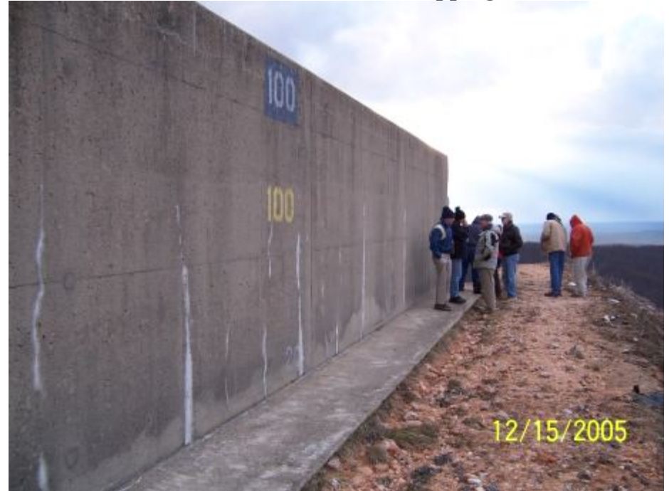
Figure 4.3 - Panel 100 Adjacent to the right side of the Breach Note erosion at toe of parapet wall footing Damage which was judged as moderate to significant