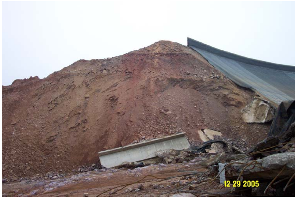
Figure 4.12 - Right side of breach Note layering of embankment