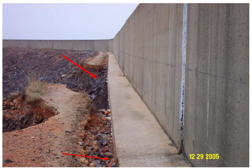
Figure 4.8 - Erosion at Panel 71 footing

Note the horizontal displacement between Panel 70 and 71(foreground) and bowing at the joint between Panels 71 and 72. Erosion at the footing is similar to that described during the September 25, 2005 wave overtopping.