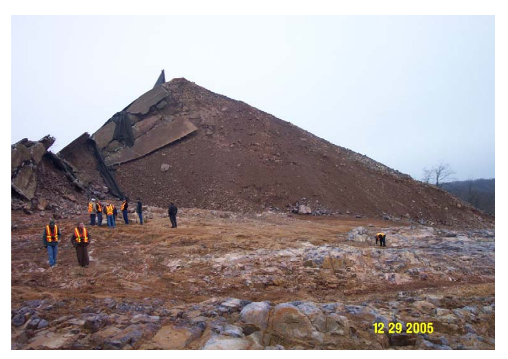
Figure 4.11 - Left side of breach