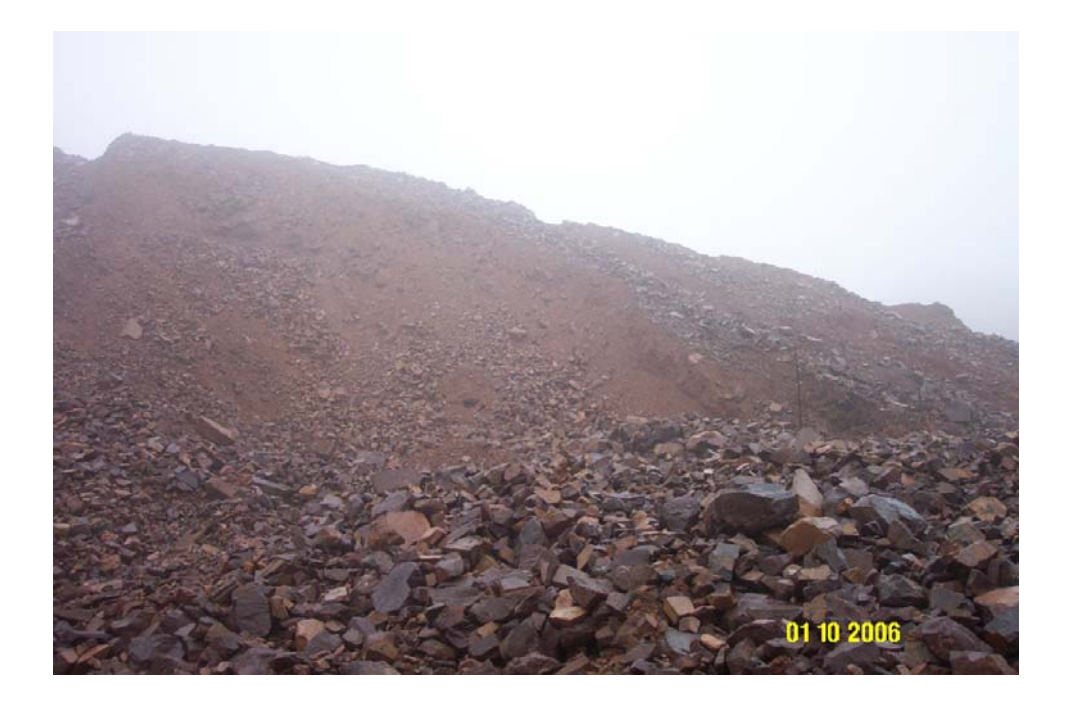
Figure 4.9 - Possible slope failure between Panel 100 and the full breach section

AmerenUE's personnel identified the damage that occurred on September 25, 2005 as "ruts and trenches" adjacent to panels 90-96. The operators reported depths of 6 inches to 1 foot. The operators subsequently repaired and regraded the damage using crushed rock, with most of the rock used to repair and improve the access road. No formal procedure was used to repair the trenches and the ruts.