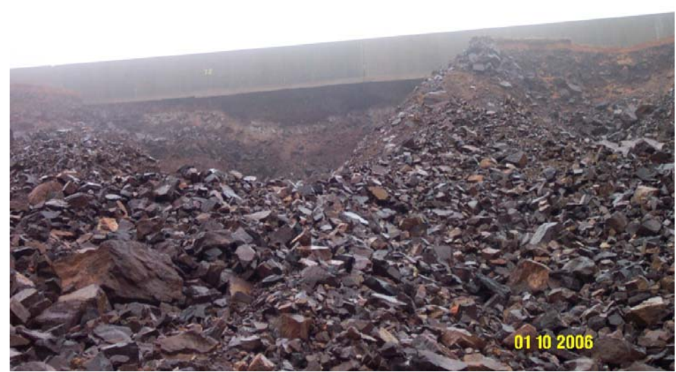
Figure 4.7 - Panel 72 Note erosion deep beneath the parapet wall Damage judged as significant Estimate 0.7 ft of overtopping