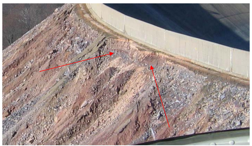
Figure 4.4 - Erosion Panel 48/49 Note scarps that may be the results of a localized slope failure Damage judged as significant Estimate 0.5 ft of overtopping

The elevations of Panels 100 and 101 were measured between elevations 1597.67 and 1597.82 ft (Figure 4.3). The damage at Panel 100 and 101, which was judged as moderate to severe, does not appear to agree with the estimates of the peak reservoir estimates occurring on December 14, 2005. However, wind-induced waves could have overtopped these walls by several inches on December 14, 2005. Damage may have been the result of the December 14, 2005 event and/or the September 25, 2005 wave overtopping event.