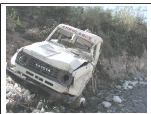
3,149 km of Haiti's 4,160 km of highways are unpaved. (Source: CIA World Factbook 2002.) Here, the wreckage of a Red Cross ambulance remains at the side of a mountain road.

Now picture these conditions— I can't resist saying it— a mere hour and a half from Miami. From door to door, Harvard to central Haiti, my monthly journey takes only 12 hours, and a third of that is spent jolting along in a Jeep. This brings me to one last point about current conditions: Haiti's roads are also a threat to public health. Recently, our team revived a young man dying from AIDS. We gave him antiretrovirals and he gained, in the course of three months, over 25 pounds. He felt, as he put it, "as good as new." Any doctor takes enormous satisfaction in such victories— it's what makes our work worthwhile. But a year into therapy he was traveling on a public bus that plunged over a steep embankment. Our patient was saved from AIDS but died of poor road conditions.