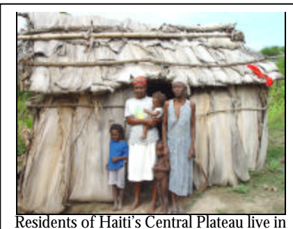
Residents of Haiti's Central Plateau live in destitution. Poor housing conditions facilitate the spread of disease.

Finally, I'll note for the record that I have written several books and dozens of scholarly articles about health conditions in Haiti. In short, I've spent my entire adult life worrying about the topic we're here to discuss today and feel well-placed to comment on Haiti's health crisis, its causes, and— most importantly— what we might all do to help our neighbor overcome this crisis.