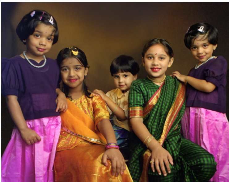
This photo shows some of the younger performers who danced in the 1999 Diwali Festival arranged by the BERA Indo-American Association.