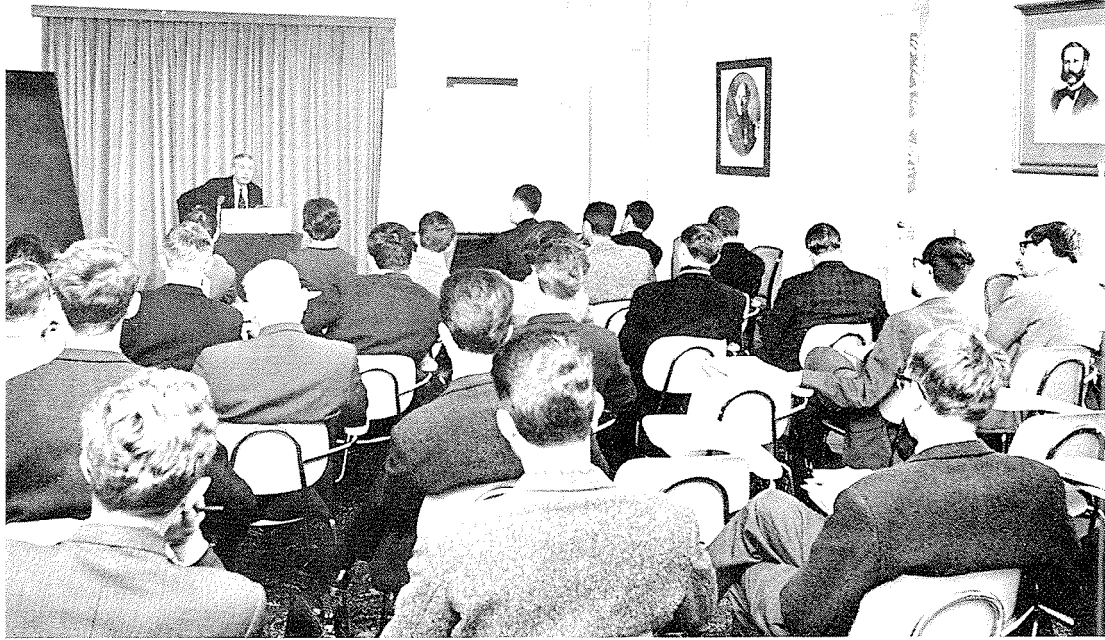
Geneva: Training course organised by the ICRC