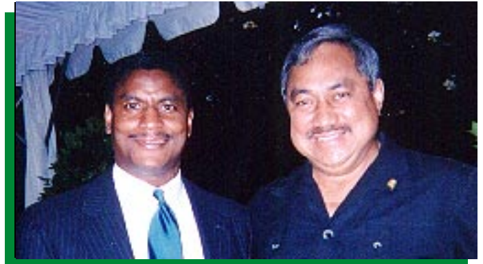
Congressman Faleomavaega and U.S. Secretary of Transportation Rodney E. Slater. Among other issues, they discussed the $33.84 million in highway funds Faleomavaega fought for and received on behalf of American Samoa.

The debate and negotiations over the transportation legislation were especially acrimonious in this Congress because of the 18.4 cents-a-gallon federal gas tax, which is collected nationally and which funds the transportation bill. In many states, residents contribute more in federal gas taxes than the state receives through the highway programs which are funded by the transportation bill. Other states