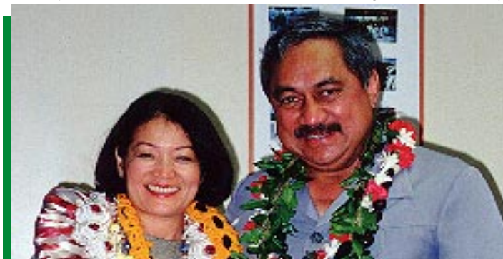
Faleomavaega and Hawaii Lt. Governor Mazie Hirono discussed funding for special federal programs which provide assistance to Samoans living in Hawaii and other parts of the mainland.

I la ma'ua feiloa'iga ma talanoaga ma le Peresitene fa'atasi ma (Flosse Fa'auau ile itulau lona 3)