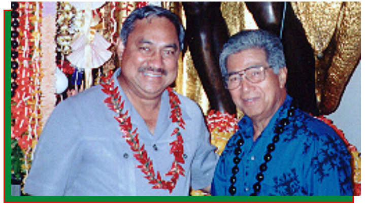
The two Polynesians in the U.S. Congress, Congressman Faleomavaega and Hawaii's U.S. Senator Daniel K. Akaka, in front of a statue of King Kamehameha in the U.S. Capitol. They briefly discussed the status of the Interior Appropriations bill which contains American Samoa's CIP and government operations funding—currently pending in the U.S. Senate.

The Senate Committee on Appropriations passed its version of the Interior Appropriations bill with a reduction of $230,000 for ASG's government operations. As this newsletter went to press, a date for consideration by the full Senate had not been set. Any differences between the House and Senate bills will need to be resolved in a House-Senate Conference Committee, and the President's advi-