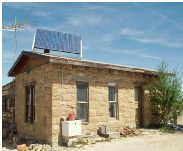
Figure 4. The 240 watt model unit deployed in Hotevilla, Arizona, is owned and operated by a former NativeSUN employee. It is sufficient for a small direct current (DC) television, a radio, and two 22 watt DC fluorescent circular lights.

Customer Vesting. Five newly hired technicians took an intensive two-week PV course from Appropriate Technology Associates (now operating as Solar Energy International) in Carbondale, Colorado. The technicians returned to the Hopi Reservation to install five model solar electric systems in the Third Mesa villages of Hotevilla, Oraibi, and near the First Mesa village of Tewa. Hopi-speaking installers translated the information about the array and the balance-of-system to the Hopi speaking customers. They explained operation and maintenance in detail to help the customer use the batteries efficiently. The system's user passed on the information to curious visitors. This word-of-mouth advertising benefited the business. Many people recognized the convenience of flicking on a switch for lights that replaced kerosene lanterns. They saw the potential of using the system for their various needs, including sewing machines, small power tools, vacuum cleaners, microwaves, and televisions.