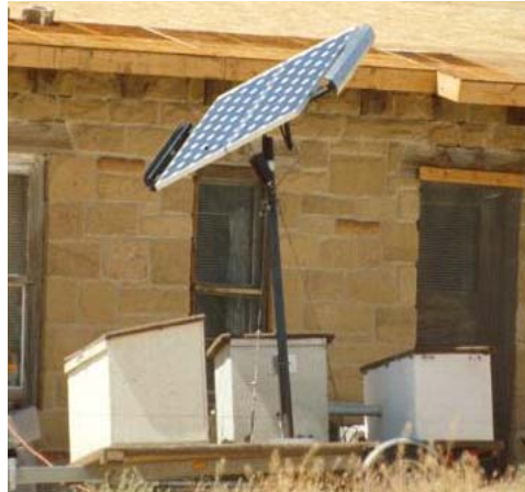
Figure 6. Solar on Wheels

size, hardware, and price. This full-disclosure approach proved an integral part of the success of the systems.