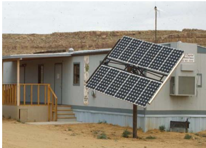
Figure 5. NativeSUN Office in Kykotsmovi, Arizona

Using some of the initial grant funds, NativeSUN's office building was retrofitted with a 900 watt photovoltaic array on passive tracking mount and BOS, 500-watt wind turbine, Solatube® tubular skylights, direct current (DC) water pumping system with a 300 gallon cistern, composting toilet, and a DC powered evaporative coolers. All of these components worked together to show consumers that NativeSUN was living the example of sustainable solar systems.