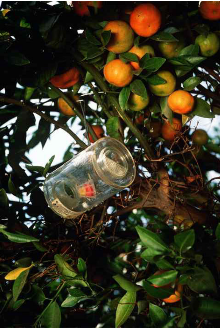
Figure 3–3. The Steiner trap (made of plastic) is often used to monitor the effectiveness of the sterile insect technique.

Typically, in Medfly programs, when trapping and subsequent fruit cutting determine that a property is infested, all host fruits on the property and those properties immediately adjacent are stripped promptly and disposed of according to APHIS protocols. With fruit stripping, only the actual host material (the fruit) is removed, causing little or no detrimental effect to the health of the plant. The area stripped of host fruit normally includes all properties within 200 meters (656 feet) of the confirmed larval site. The host fruit may be destroyed by burial, incineration, or a combination of both methods at an approved landfill or refuse site. The legal and logistical aspects of collecting and disposing of the fruit are a