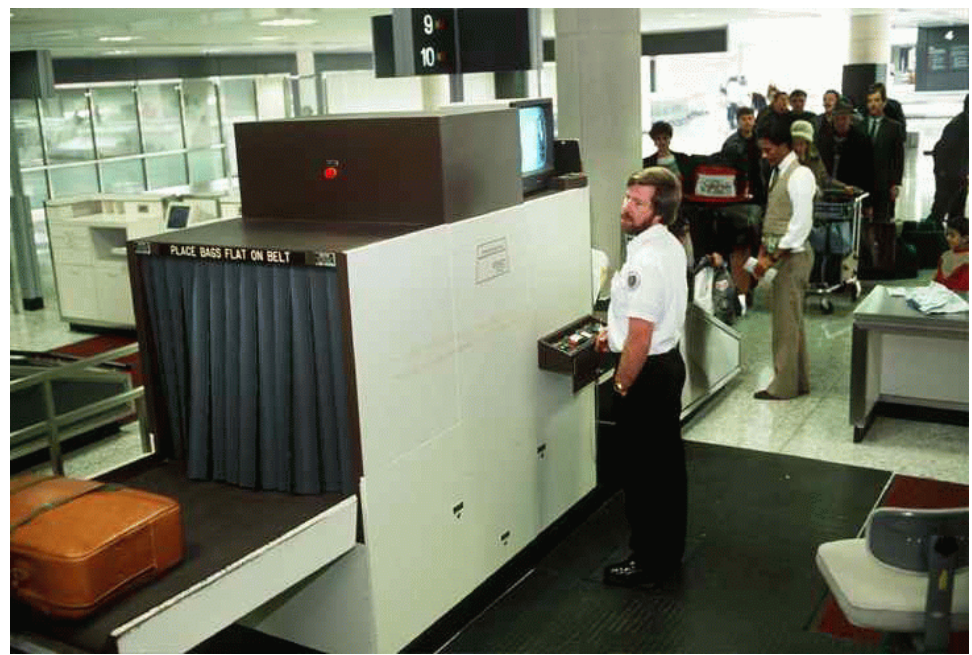
Figure 6–1. X-ray machines are used to screen passenger baggage at some of the larger air terminals.