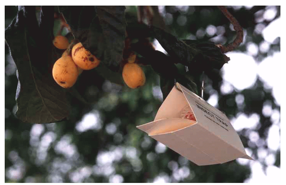
Figure 1–3. The cardboard Jackson trap is one type of trap used to detect and delimit fruit fly infestations.