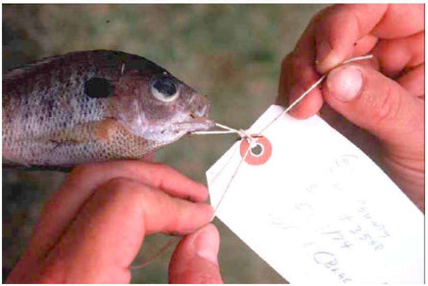
Figure 7–1. Monitoring samples are tagged and sent for laboratory analysis.

In fruit fly programs (which usually occur in suburban areas), the emphasis of the environmental monitoring will be on the protection of human health. Monitoring (with dye cards, water, and vegetation samples) may be used to ensure that spray buffers adequately protect sensitive sites from spray drift or misapplications. Specific environmental components may be sampled in response to complaints about perceived impacts of treatments or lack of effectiveness of mitigative measures.