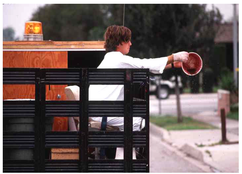
Figure 3–2. Release of sterile Medflies from the back of a truck in a suburban neighborhood.

For an integrated program, the range of environmental consequences to human health, nontarget species, and the physical environment would depend upon the control methods used. However, integrated programs (especially eradication programs), under careful program supervision, which use chemical pesticides as control tactics, are expected to have less adverse impacts than no action or nonchemical programs which would be expected to result in continually escalating private uses of pesticides (as pest infestations spread). Eradication has an end point; private use has no end point and would result in much greater use of pesticides over the long-term. In addition, the protective measures, mitigative methods, and public information activities under a government managed integrated program would also be expected to reduce the severity of adverse environmental consequences. For example, members of the public would be informed of the times and areas of applications, and therefore would be able to take, at their discretion, the precautions required to minimize and/or avoid exposure.