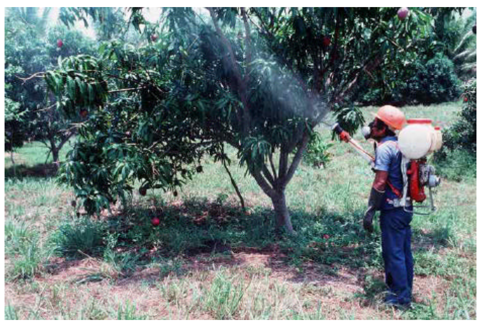
Figure 3–6. Ground applications of malathion bait precisely target fruit fly hosts.