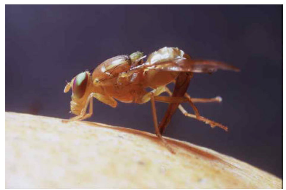
Figure 1–1. The Mexican fruit fly is one of many damaging fruit fly pests of agriculture.

There are at least 80 species of fruit fly pests belonging to the dipteran genera Anastrepha , Bactrocera , Ceratitis , Dacus , Rhagoletis , and Toxotrypana that are of concern to agricultural officials. Table 1–2 lists those species, their representative ranges, and their principle hosts. The list contains tropical, sub-tropical, and temperate species of fruit flies. All 50 States are subject to repeated introductions of one or more of these species, and the Southern States are threatened by multiple species.