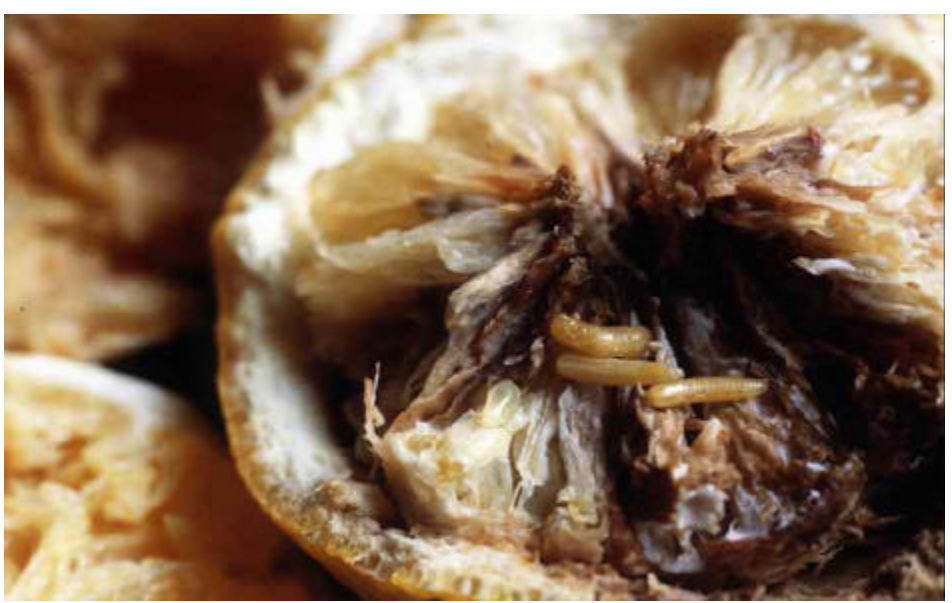
Figure 2–1. Citrus exhibiting characteristic fruit fly larval feeding damage.

The U.S. Department of Agriculture, Animal and Plant Health Inspection Service (APHIS), as lead agency in cooperation with other Federal and State organizations (refer back to table 1–1 for list), is evaluating the potential environmental effects of a broad cooperative program for the control of various fruit fly species that could be introduced to areas of the United States. This program is necessary because of the destructive potential of these exotic pests and the serious threat they represent to U.S. agriculture. Refer back to table 1–2 for a list of the fruit fly species, their representative ranges, and their principle hosts.