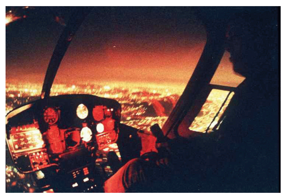
Figure 3–5. Some aerial applications are made at night to minimize exposure of area residents.

Spinosad has been used successfully in recent fruit fly eradication programs. If spinosad remains available for use, it may serve as an alternative to malathion in aerial bait formulations for primary control or for regulatory treatments. Aerial applications are currently restricted to use in orchards and croplands. Aerial applications may not be applied to fruit fly infestations in residential areas. Refer to the previous discussion on aerial malathion bait for further insight into how spinosad might be used in aerial bait applications.