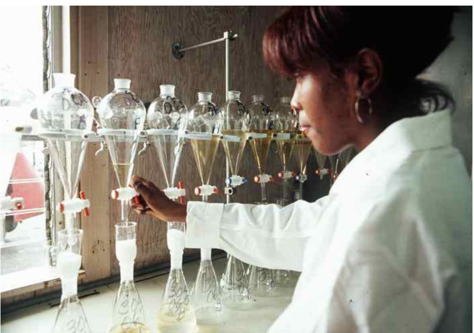
Figure 7–2. Quantitative analysis of residue samples at the laboratory.

For chemical treatments (malathion, spinosad, SureDye, diazinon, chlorpyrifos, fenthion, and methyl bromide), the purity of the chemical and the precision of the formulation will be determined. Program pesticide applicators will follow standard operating procedures described in this EIS and in the guidelines, policies, and manuals of APHIS and program cooperators.