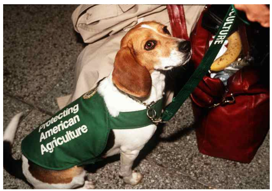
Figure 3–1. Detector dogs are trained to find smuggled fruit at airports, seaports, and land border ports.

cooperates, however, in a Mexican fruit fly suppression program in the Lower Rio Grande Valley of Texas. (The Mexican fruit fly is found over a wide area of Mexico and also in the Lower Rio Grande Valley.) This program is predominantly a nonchemical suppression program using sterile insect technology, but includes some chemical regulatory commodity treatments.