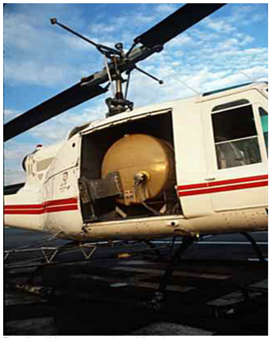
Figure 3–4. Helicopters are used to aerially apply malathion bait in some control programs.