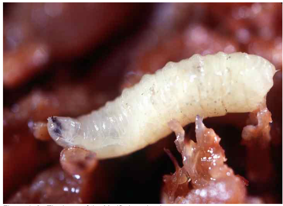
Figure 1–2. The larva of the Medfly is a slender, creamcolored maggot.