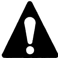
FIGURE 2 TO PART 1407—SAFETY ALERT SYMBOL

[72 FR 1450, Jan. 12, 2007; 72 FR 2184, Jan. 18, 2007]