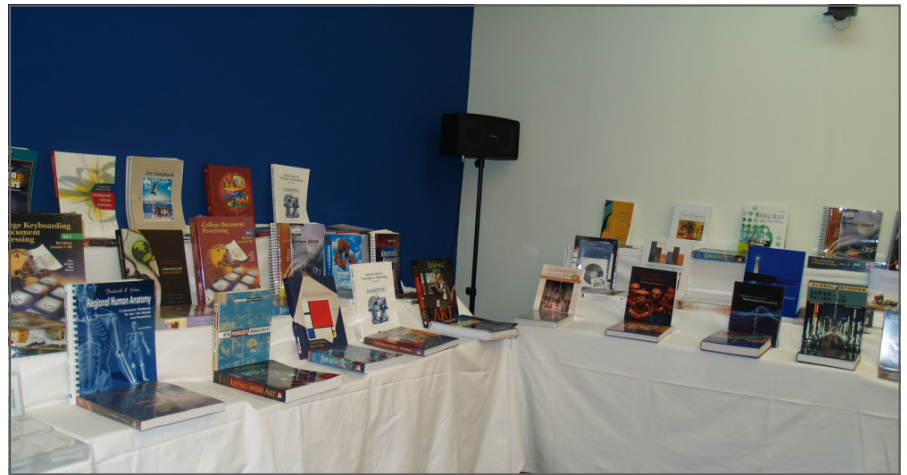
Sample display of books at the donation ceremony.

BBF is a non-profit organization that provides books, food, medical supplies, pharmaceuticals, and other humanitarian assistance around the world. Since its founding in 1958, it has provided over 58 million books to more than 25 million students in over 50,000 academic institutions throughout the globe. It is the largest distributor of privately-donated books in the world.♦