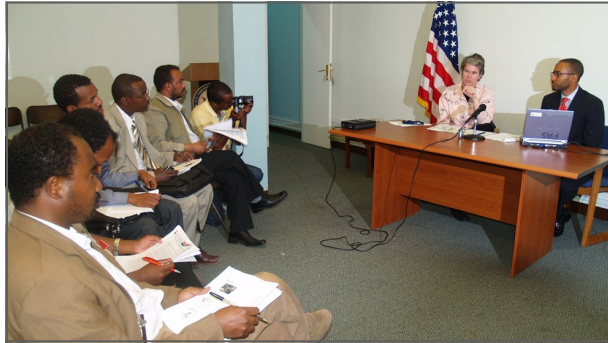
Journalists listen to the presentation by consular officers.

The EVAF process produces a three-page printed form that incorporates the applicant's biographical data into an electronic barcode system. The barcode allows consular staff to quickly input the applicant's information into the computer system, saving time since no data-