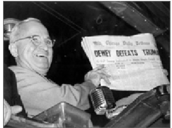
Following Election Day in 1948, President Harry Truman displays a newspaper that mistakenly announced his defeat.

But Allen's "fumbling around" after he uttered "macaca" showed "much more about his personality