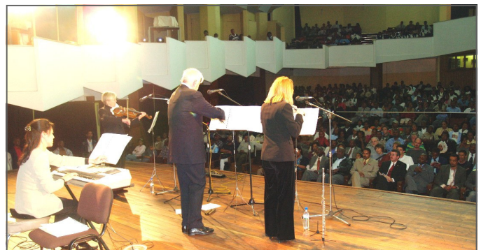
Trio Chicago performing their concert at the Addis Ababa Municipality Theatre Hall, November 15, 2007.

The five American "Cultural Ambassadors" arrived in Addis Ababa from Jordan, where they just completed a successful concert tour, and will return to the United States at the conclusion of their program.♦