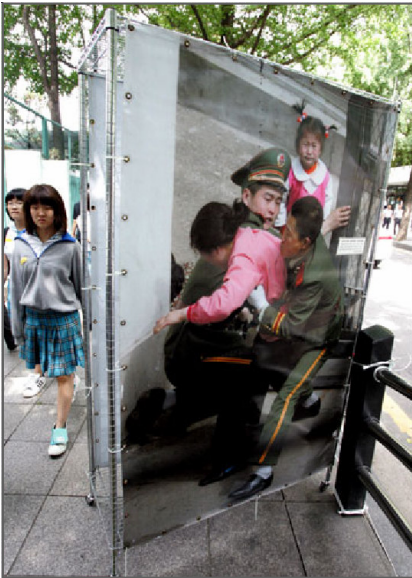
South Korean students pass by a picture showing security guards arresting a North Korean asylum seeker in Beijing.

In an address to the Transatlantic Institute in Brussels, Belgium, November 6, Whiton catalogued abuses that often go unnoticed by