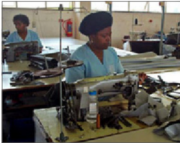
Women individually manufacture automobile parts in a South African factory.

Along with the good news on Tanzania, South Africa and Ghana, he cautioned that there are still "numerous challenges" in today's Africa that "we all know" and of which we must remain aware.