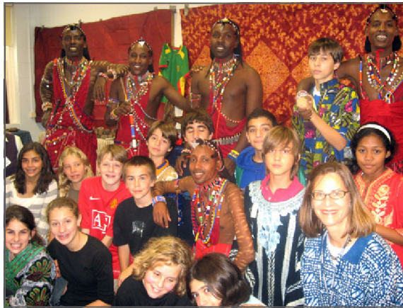
Students at Washington International School celebrate Africa Day, with help from visiting Masai tribesmen.

WIS exchange students enter the 11th grade when they arrive, and they live with host families whose children attend the school. Typically, the exchange students have not visited the United States before, so their WIS experience is usually their introduction to American life