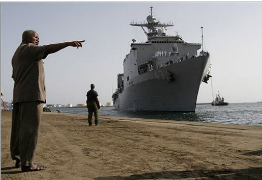
USS Fort McHenry arrives in Senegal for onboard maritime security training during a seven-month deployment to the region.

Station (APS) initiative. During its seven-month deployment, it will serve as a floating platform in the strategically important Gulf of Guinea, where it will promote regional maritime safety and security.