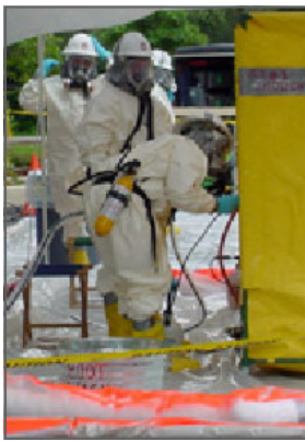
A cleanup crew waits to shower during a 2001 anthrax decontamination of a Florida building where one worker died.

Members are health ministers from Canada, France, Germany, Italy and the United Kingdom; health secretaries from Japan, Mexico and the United States; and the European Union (EU) health commissioner. The World Health Organization serves as an expert adviser to the GHSI.