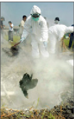
An Indonesian official throws a slaughtered chicken, culled to stop the spread of bird flu, into a hole to be burned.

The Global Health Security Initiative (GHSI) is an informal, voluntary partnership whose members met in Washington November 1-2 to review preparedness initiatives for responding to threats of biological, chemical and radio-nuclear terrorism; pandemic influenza; food and product safety; and other public health emergencies.