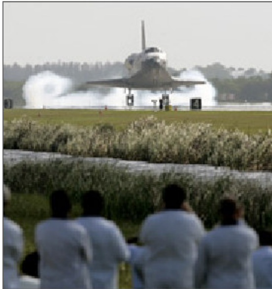
Space shuttle Discovery lands at the Kennedy Space Center in Florida November 7 after a 15-day mission.

NASA's Constellation Program is working to send astronauts to the