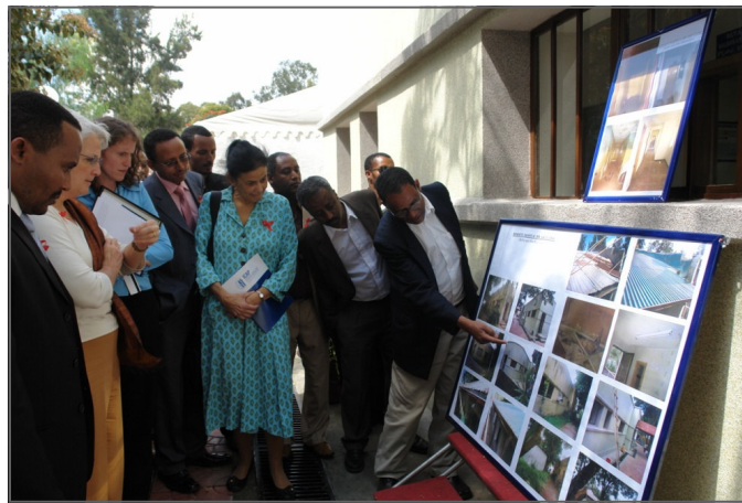
The Medical Director at Bishoftu hospital shows the before and after pictures of the health center.

of encouraging results have been demonstrated. The Bishoftu ART Clinic is now providing services to a total of over 3200 patients, of whom 2479 are in the pre-ART stage. The rest are enrolled in ART programs. This newly-renovated facility will further strengthen those