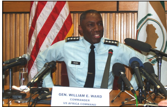
General Ward engaged in Q & A with journalists

ties in Africa under one command, allowing one commander – me – and my staff to focus entirely on all of the important activities, pro-