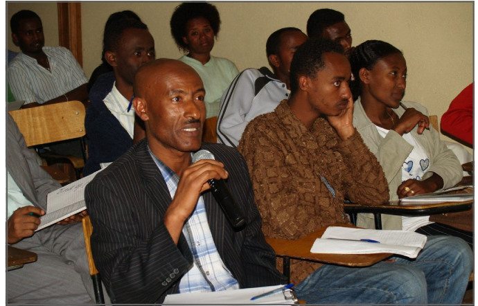
One of the attendees asking a question