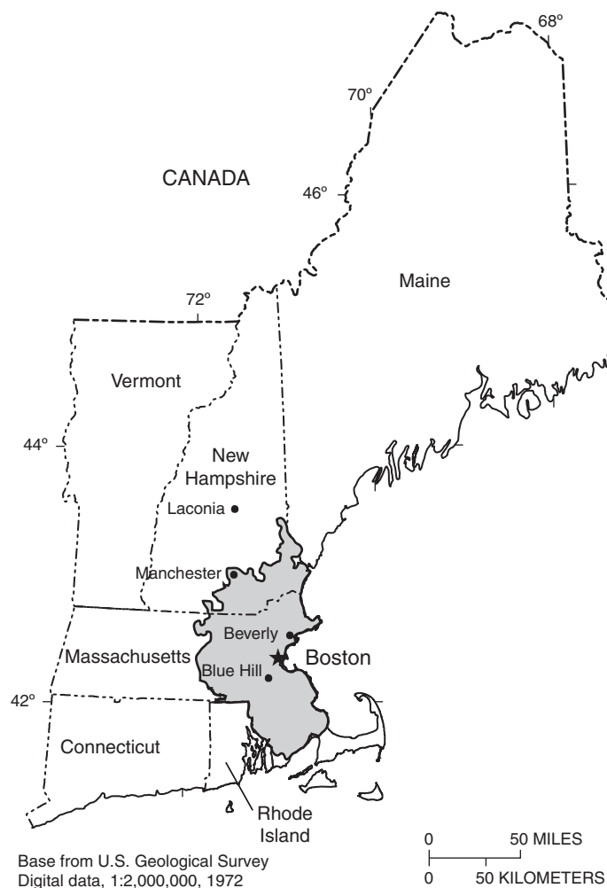
Figure 1. Location of wet-deposition samplers around the Boston, Mass. metropolitan area (in grey).

Beverly is a predominantly residential and commercial area, but is within 10–20 mi of several major sources of Hg emissions. The Blue Hill site was in Milton, Mass., at the Blue Hill Weather Observatory air-monitoring site for the Massachusetts Department of Environmental Protection. The site location, on top of Great Blue Hill just 10 mi south of Boston, was removed from local urban effects such as street dust and automobile exhaust, but surrounded by long-range emissions sources from Providence, R.I., and New York City to the south, and Boston to the north.