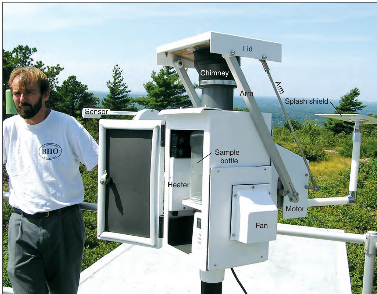
Figure 3. Top-loading N-Con mercury wet-deposition sampler, Blue Hill Observatory, Milton, Mass.

samples with sufficient volume (300 mL) for HgT and MeHg analyses. Samples with less than 300 mL were analyzed for only HgT.