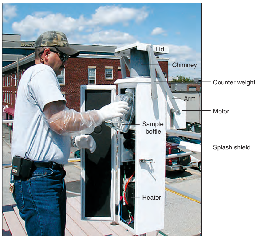
Figure 2. Bottom-loading N-Con mercury wet-deposition sampler, Manchester, Mass.

designed so the sample contacted only the laboratory-cleaned funnel assembly and PETG bottle. Control of the lid improved in the top-loading model with the use of four arms instead of two, and temperature control was improved by reducing the sampler size and internal volume, and placing a thermostatically controlled 300-watt silicone rubber plate heater next to the sample bottle (fig. 3). Wet-deposition collectors at Beverly and Blue Hill (fig. 1) were converted to the top-loading model on August 26 and 27, 2003, respectively; Laconia and Manchester sites were converted on April 20, 2004. To ensure the Hg-deposition data were not affected by the different models of N-Con samplers, the same sensor, sample-collection train, and laboratory were used throughout the study; the height of sample collection was not changed; and blank samples were collected every 3 months throughout the study.